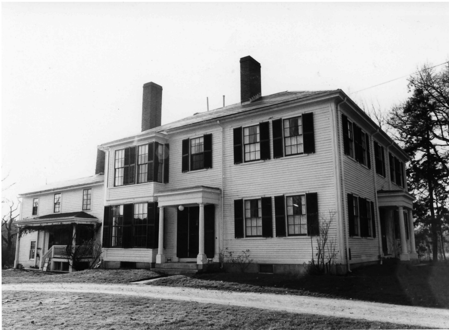
2. View from east, side of main block and service wing.