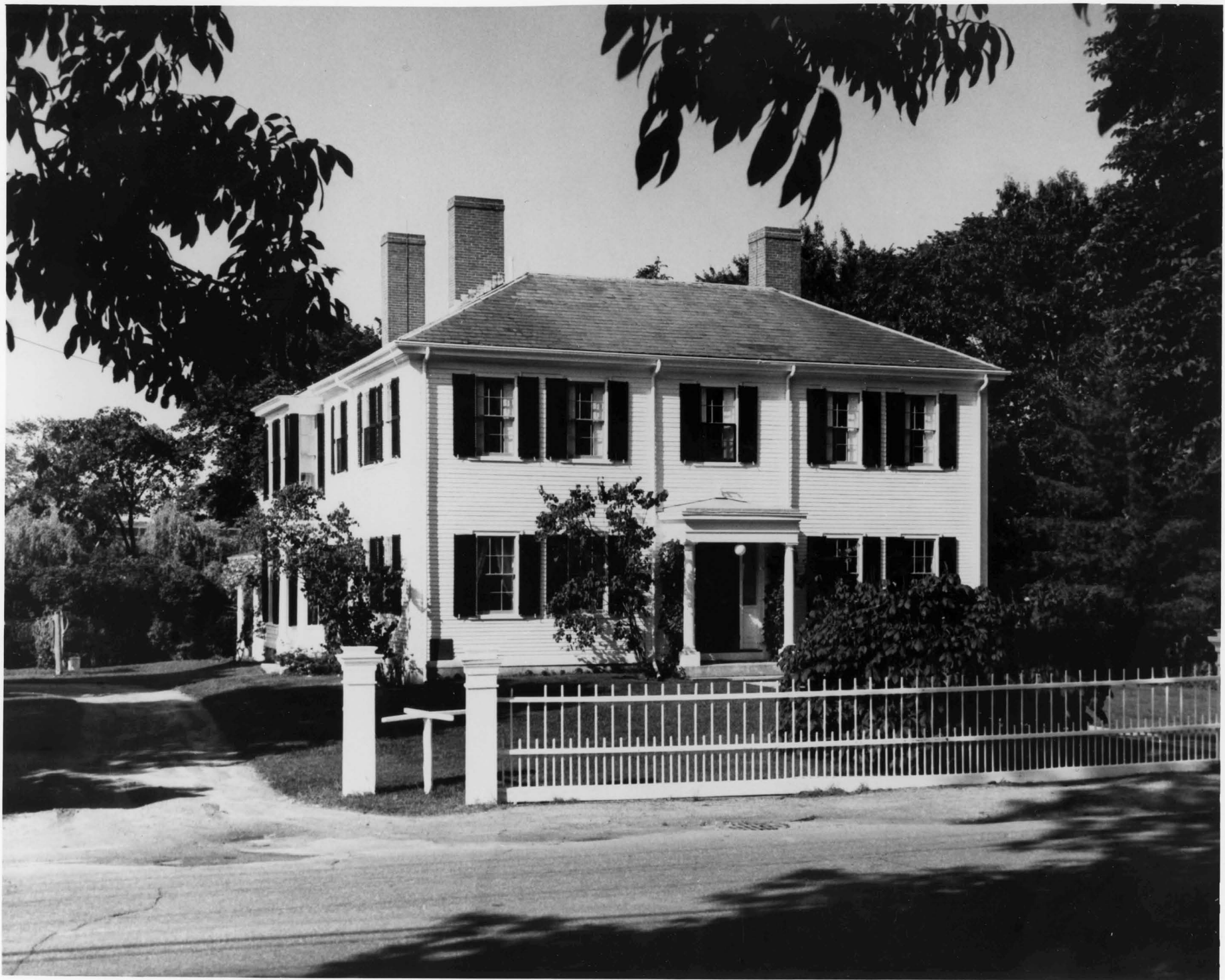
1. Home of American writer Ralph Waldo Emerson.