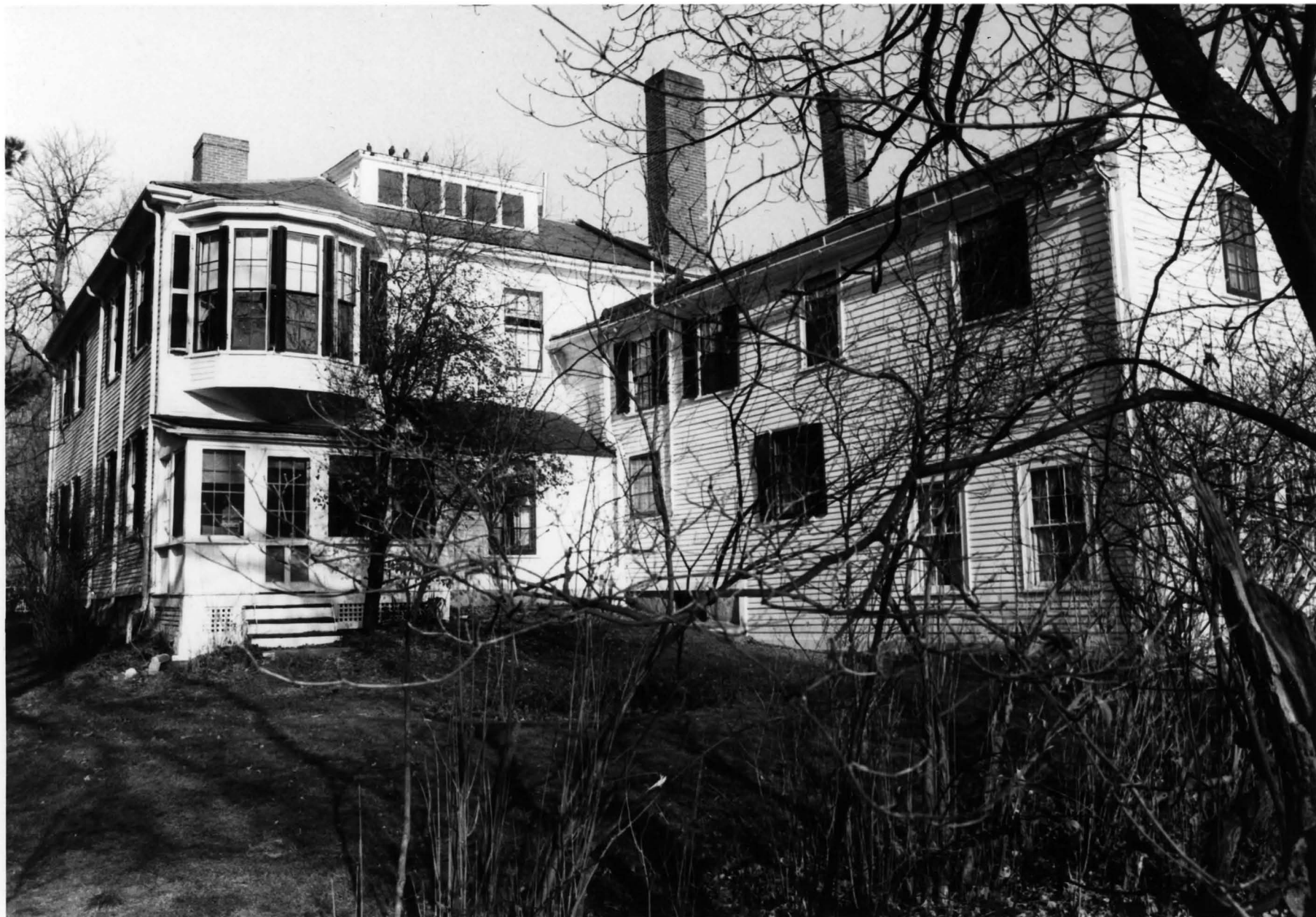
3. View from southwest, rear of main block and service wing.