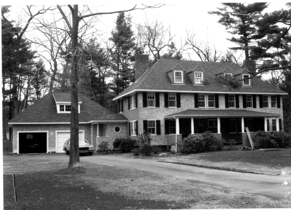
92 Alcott Road (CON. 1060)