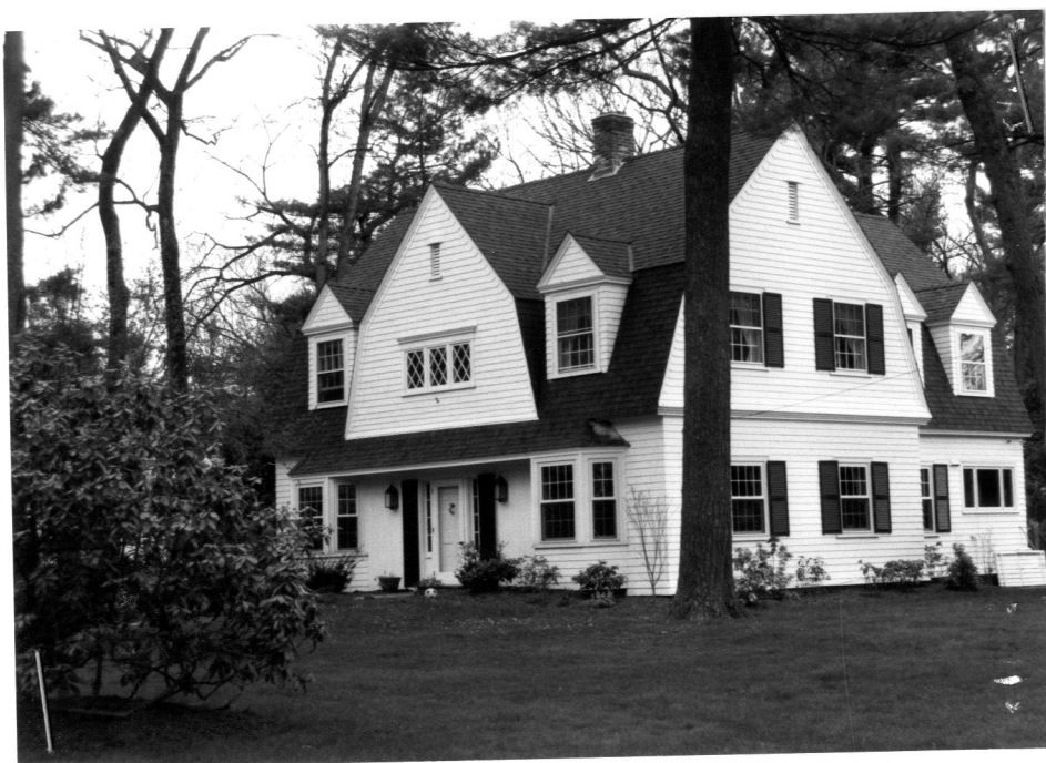
276 Independence Road (CON. 1061)