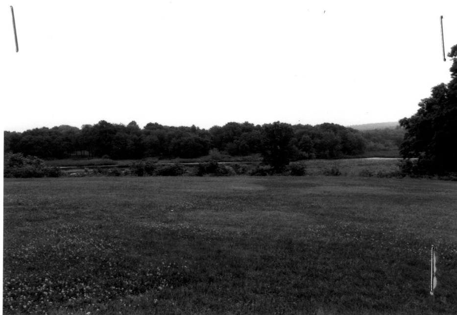
Landscape, 93 Coolidge Road