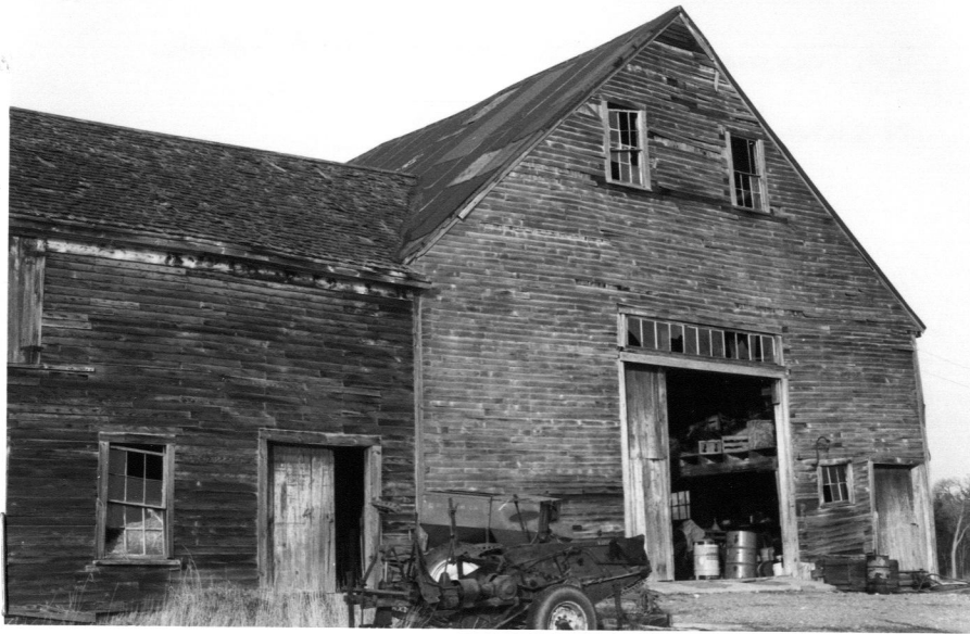
Barn - west side of house