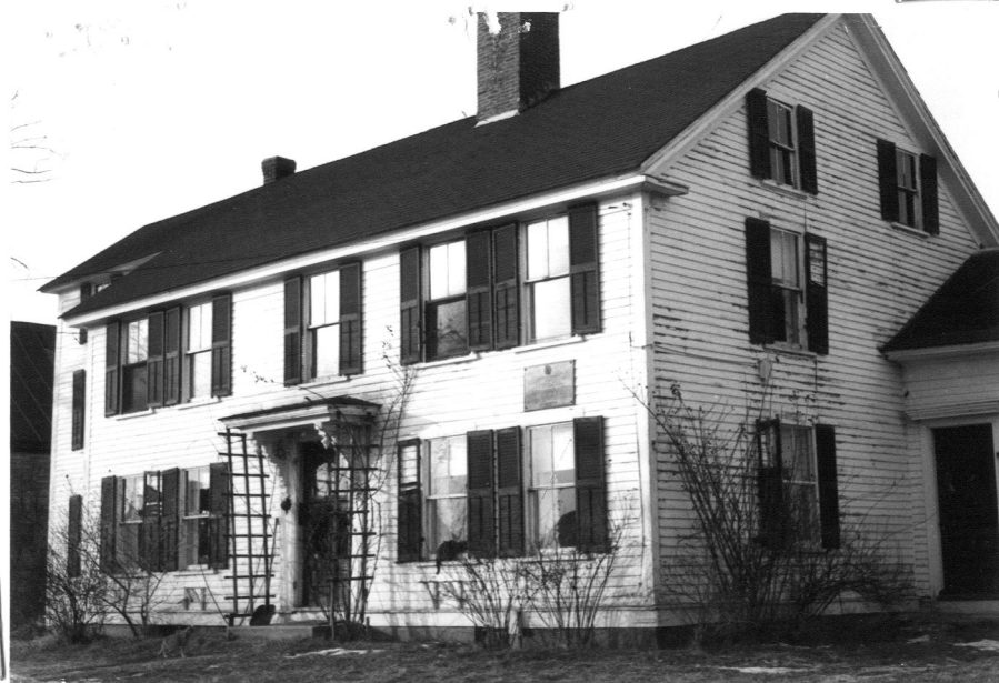
Barretts Mill Road (North side)