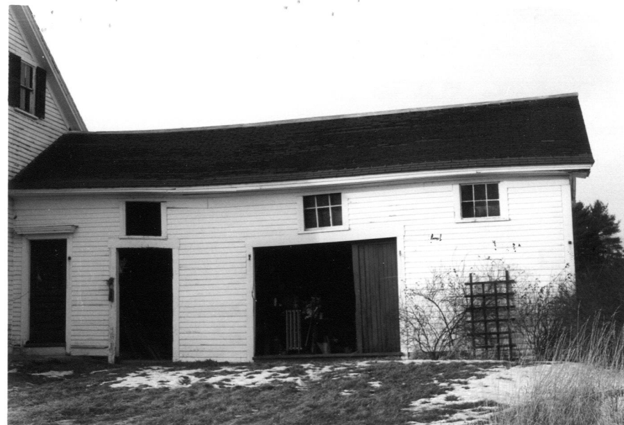
Detail barn - east side of house