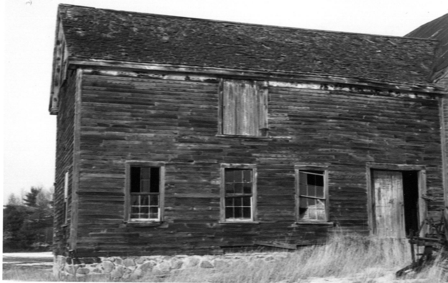
Barn - west side of house