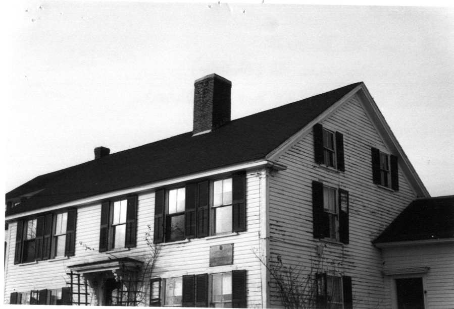
Barretts Mill Road (North side)