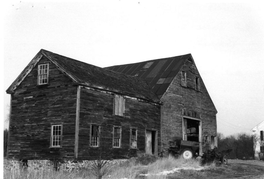
Detail barn - west side of house