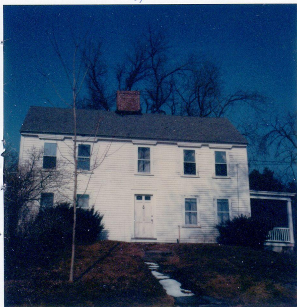
Wheeler-Merriam House 1692 Concord Ma