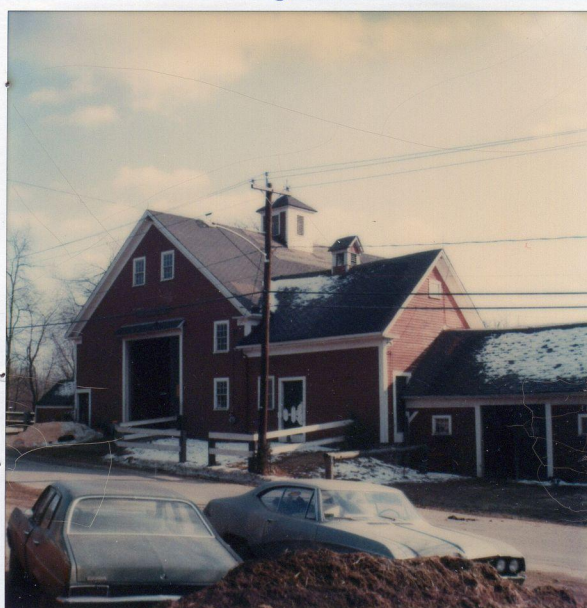
1904 Barn - diagonally opposite Wheeler Merriam House 477 Virginia Rd. Concord Ma.