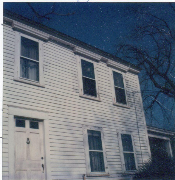
Window caps - Abner Wheeler Wheeler-Merriam House Concord Ma