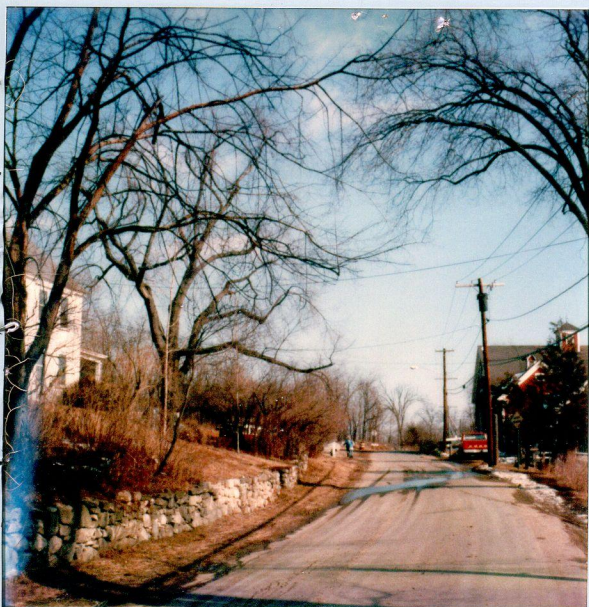
Looking East down Virginia Rd - House on Left - Barn on right Wheeler-Merriam House Concord