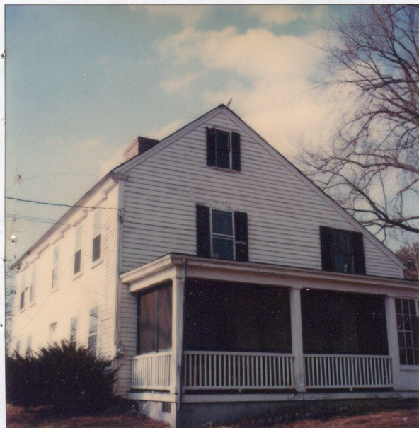
East end of Wheeler- Merriam House - Virginia Rd