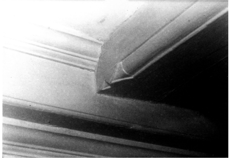
77:20 "pip" chamfer stop