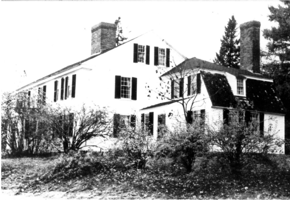
77:19 Main view of house