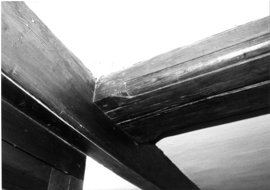
76:2A-3 Binding summer beam with quarter-round chamfer and taper stop in southeast chamber