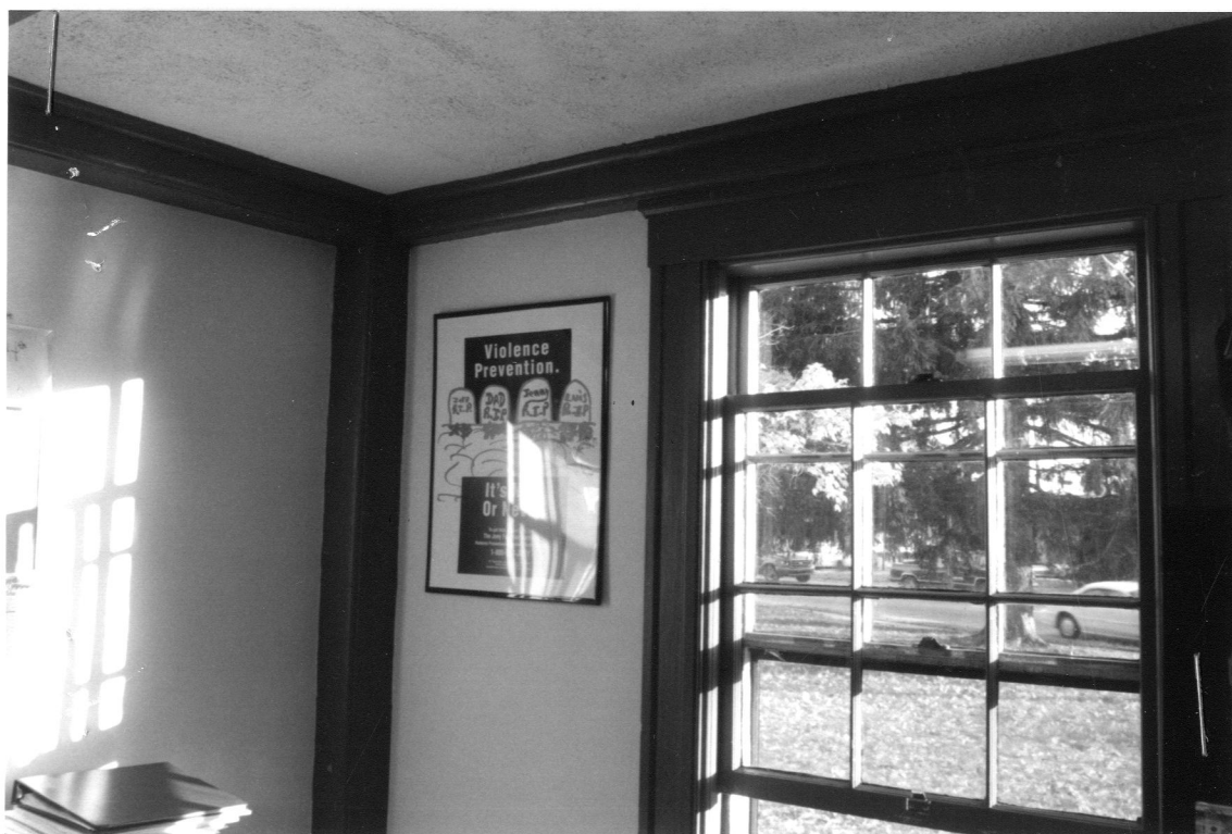
NW First Story Room