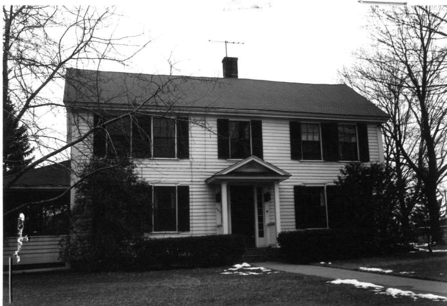
Dr. Cummings House Reformatory Circle (CON. 452)