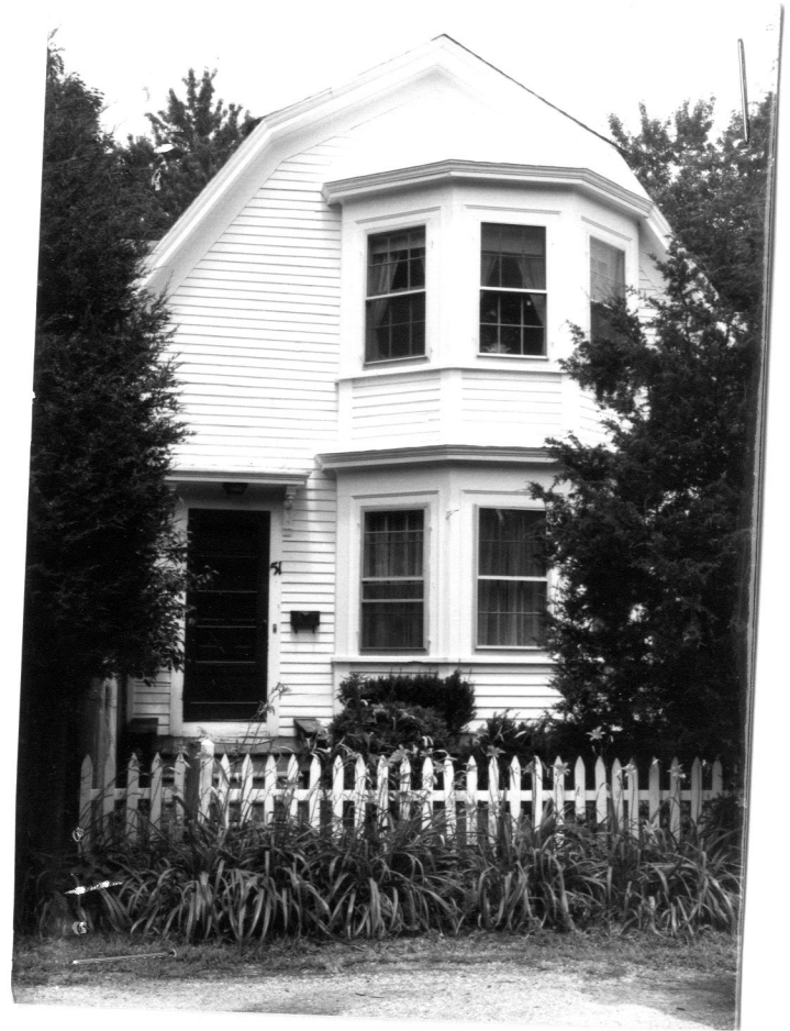
51 Cottage Lane (CON. 643)