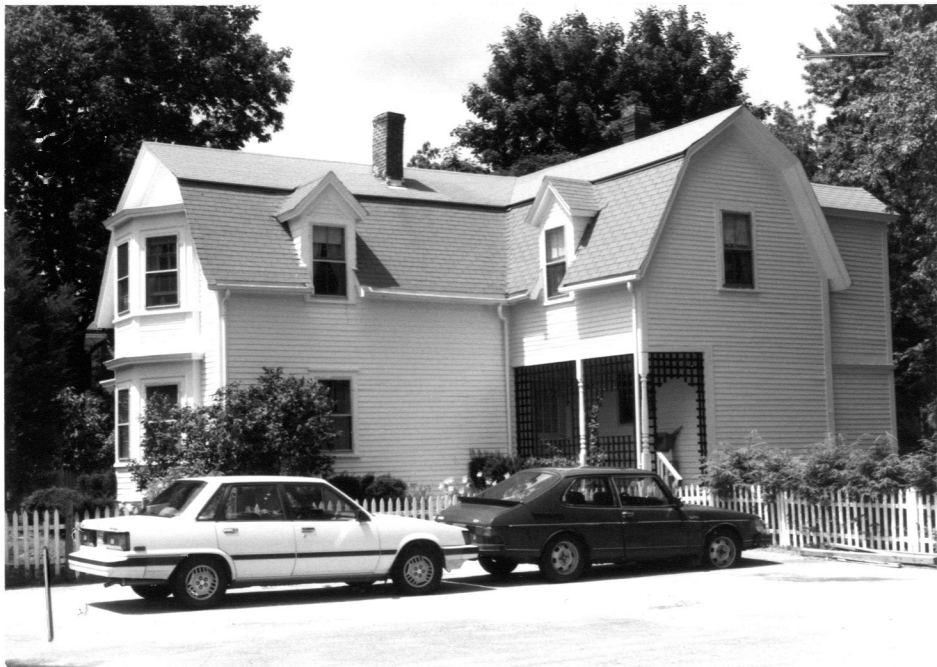
51 Cottage Lane (CON. 643)