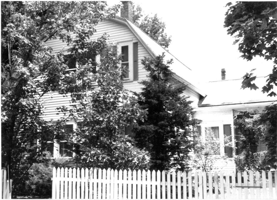
29 Cottage Lane (CON. 641)