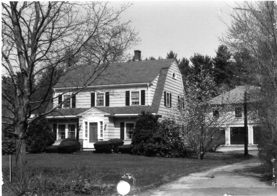
602 Main Street (CON. 721)