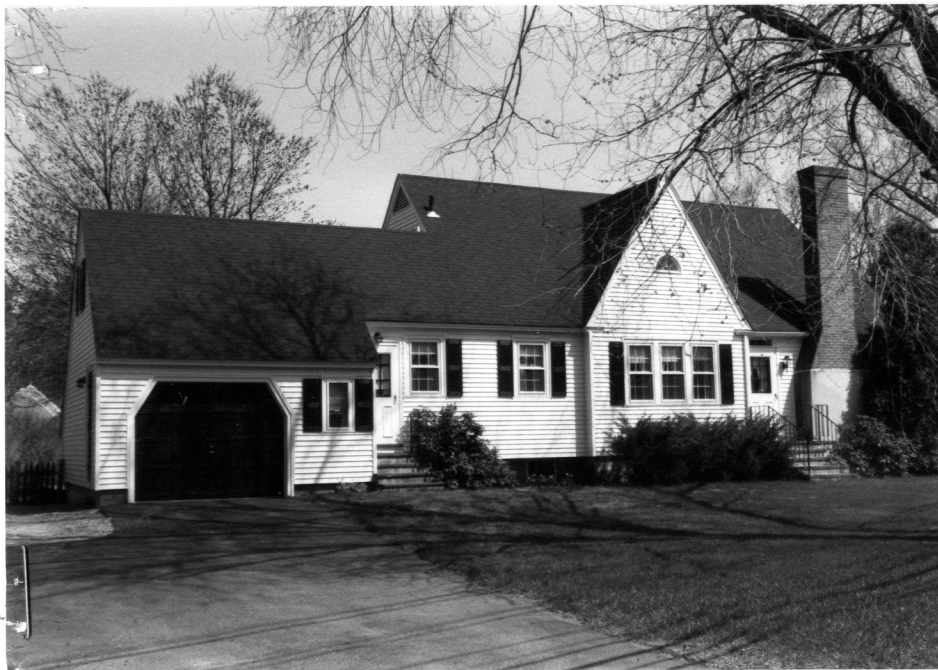
622 Main Street