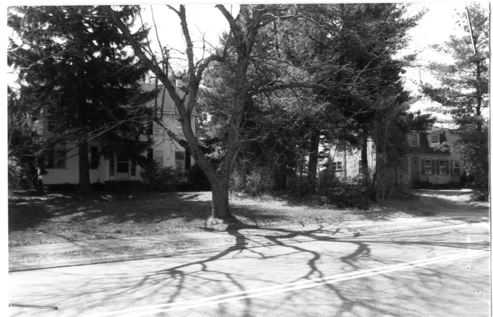
653 and 661 Main Street (CON. 723)