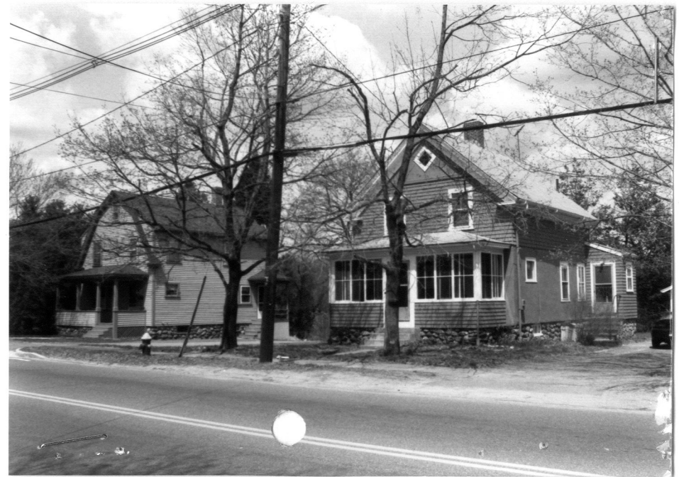
838, 844 Main Street (CON. 739 and CON. 741)