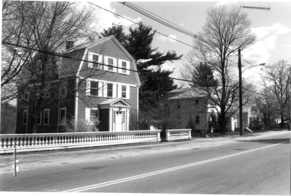
828 Main Street → East (CON. 737)