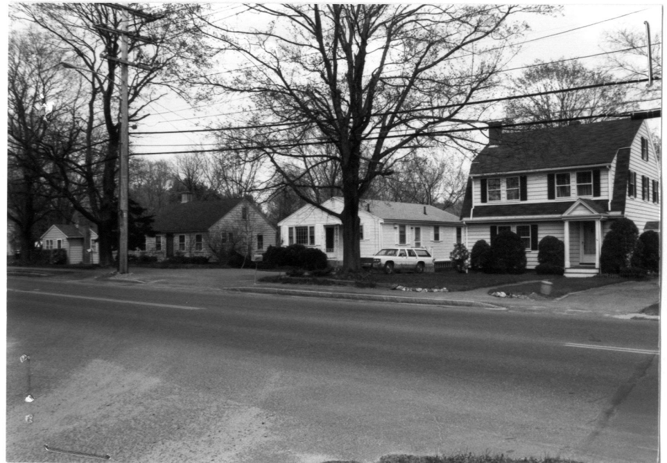
744- 760 Main Street