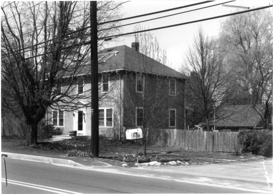
696 Main Street (CON. 725)