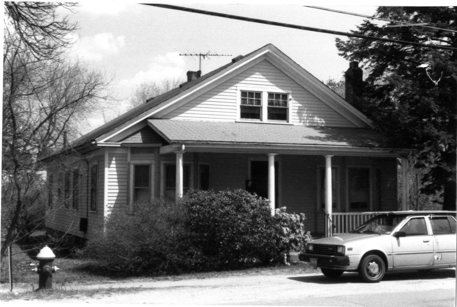
788 Main Street (CON. 732)