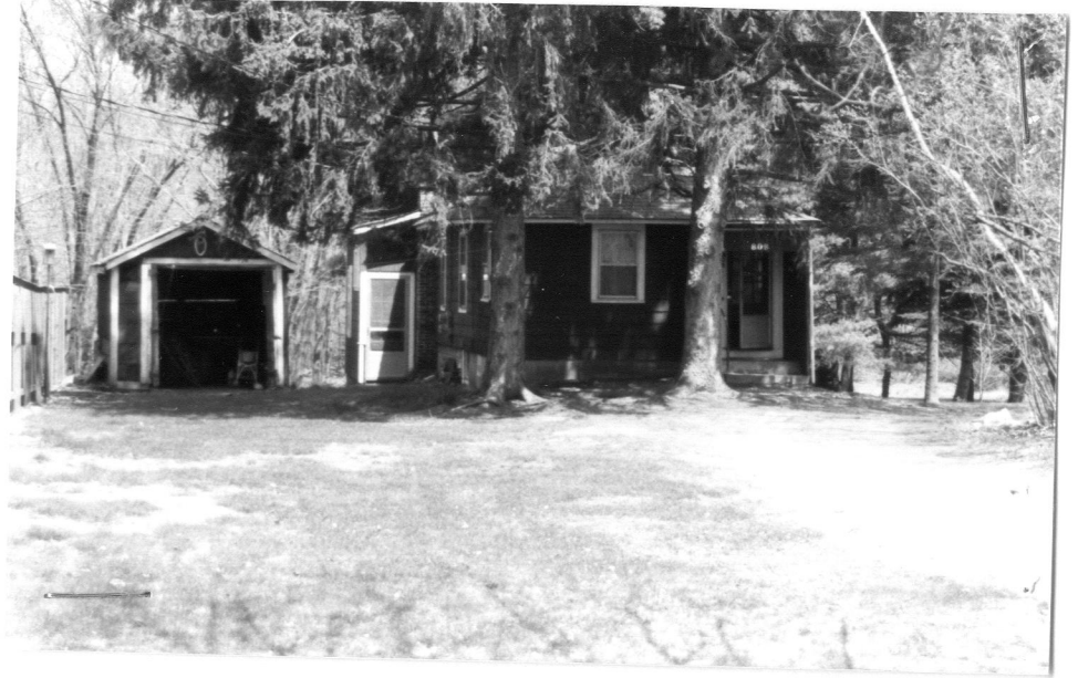
808 Main Street (CON. 734)