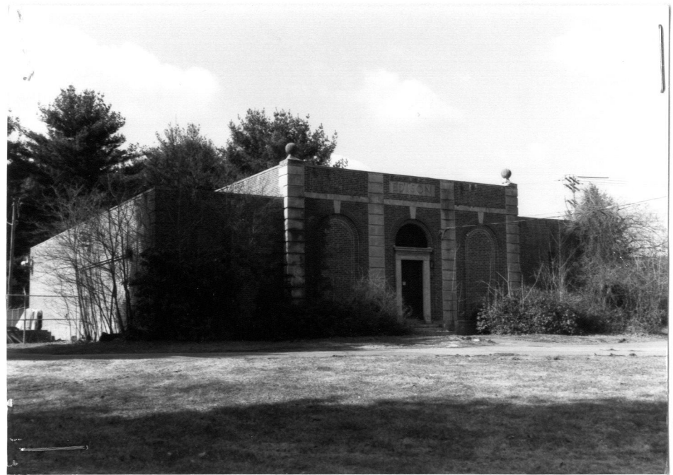
720 Main Street - Edison Light Plant (CON. 727)