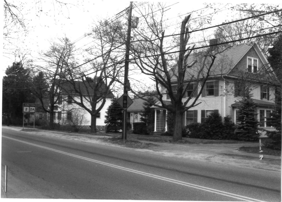
770, 780 Main Street (CON. 730, CON. 731)