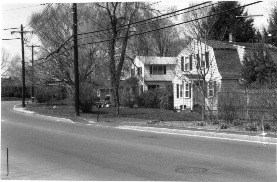
712, 724 Main Street (CON. 726)