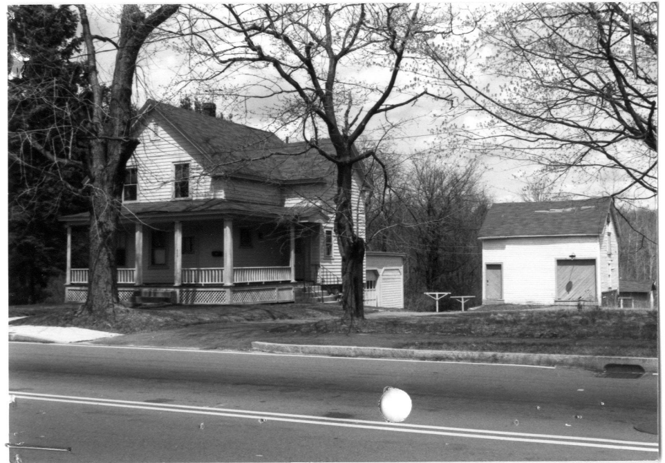
858 Main Street (CON. 742)