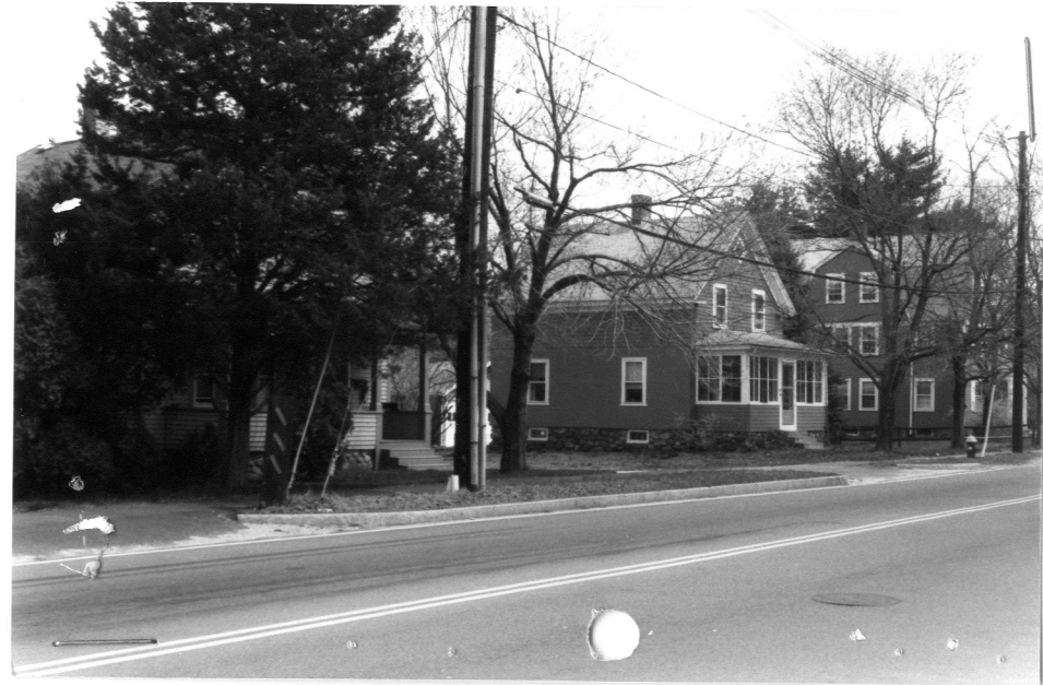
844 Main Street → East (CON. 741)