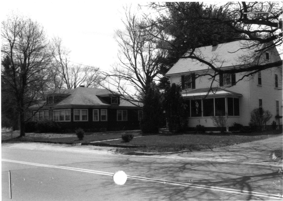
839, 831 Main Street (CON. 740, CON. 738)