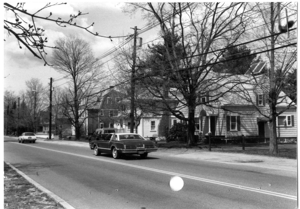
812-828 Main Street