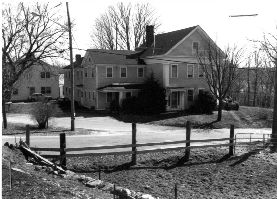
415 Plainfield Road (CON. 420)