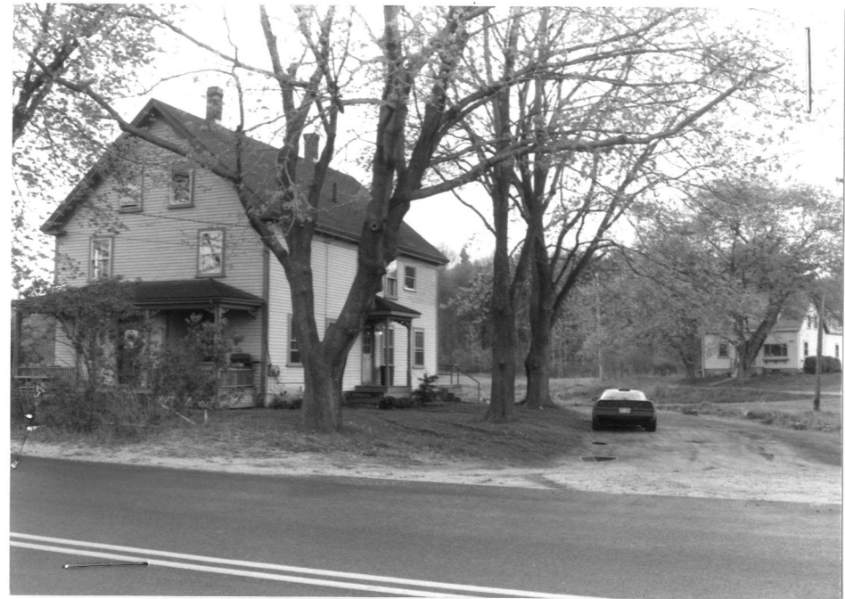
1535 Sudbury Road (CON. 423)