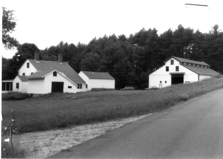
509 Garfield Road