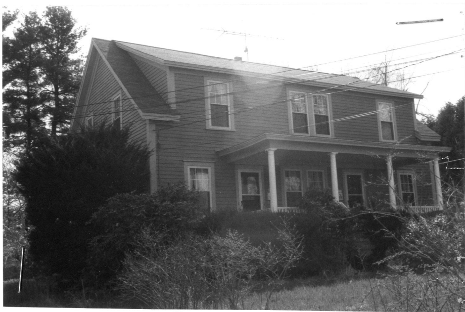
304-306 Thoreau Street (CON. 786)