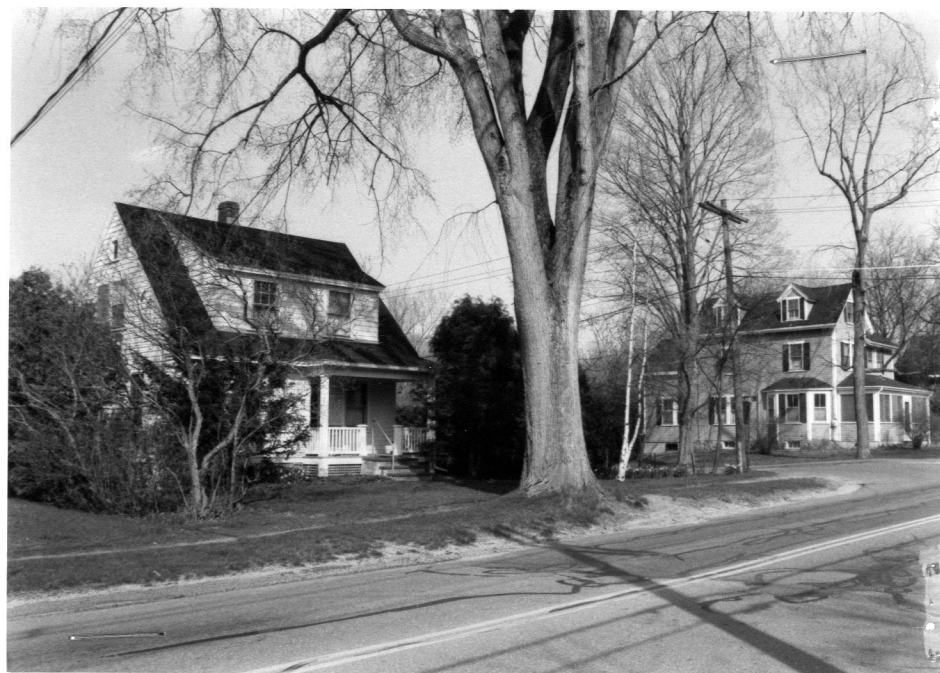
333 Thoreau Street (CON. 792)