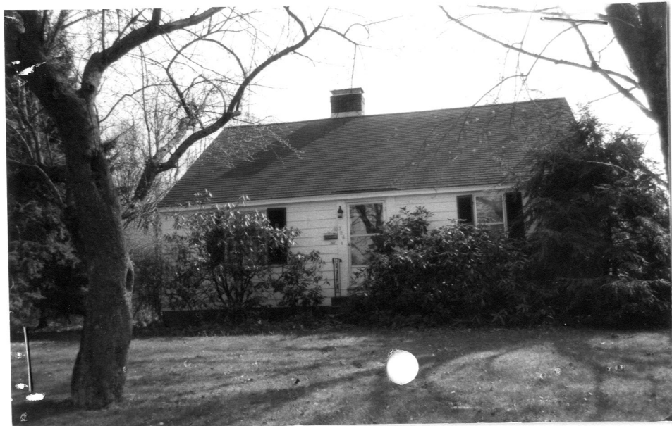
326 Thoreau Street (CON. 791)