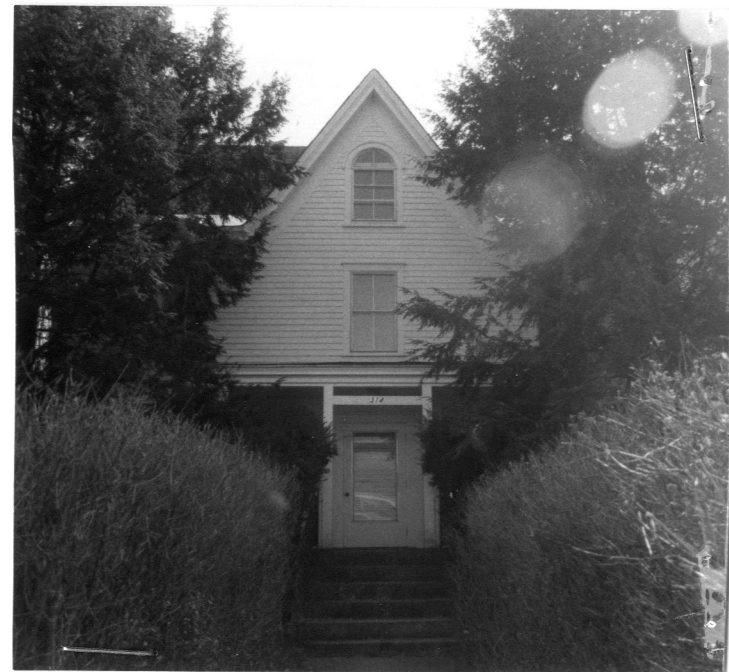
314 Thoreau Street (CON. 789)