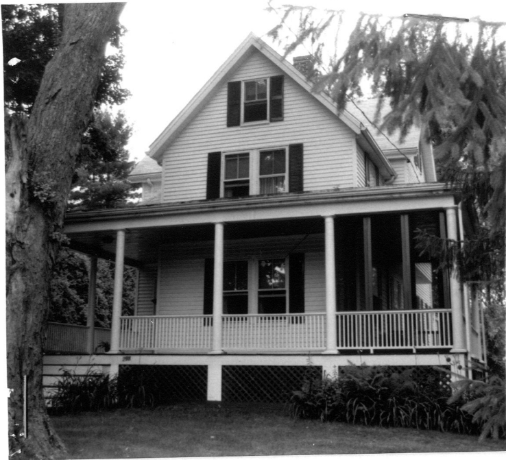
298 Thoreau Street (CON. 785)