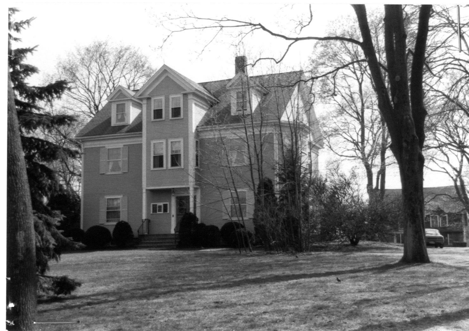
352 Thoreau Street (CON. 794)