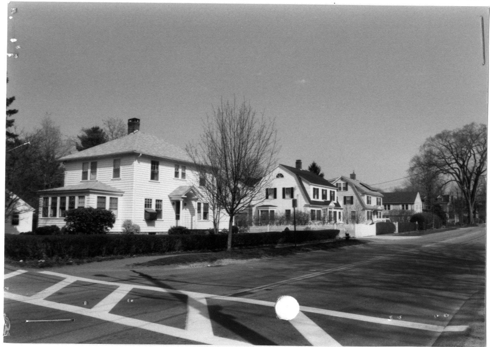
305-313 Thoreau Street