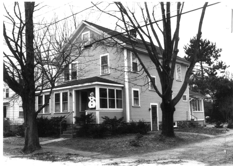
60 Laurel Street (CON. 1020)