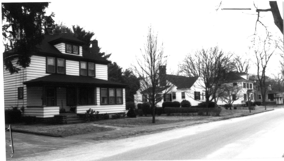
South side Laurel Street