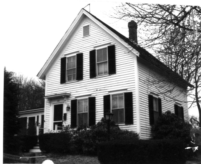
108 Laurel Street (CON. 1022)