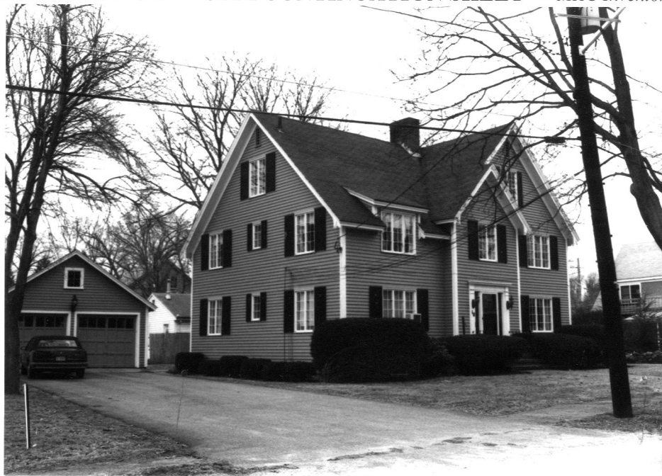
18 Laurel Street (CON. 1015)