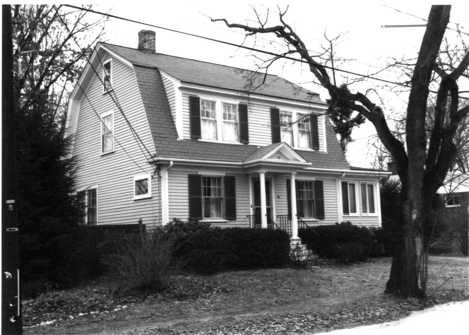
36 Laurel Street (CON. 1017)