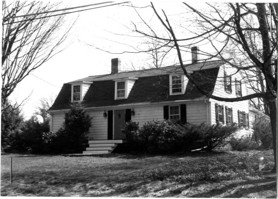
540 Thoreau Street (CON. 1026)