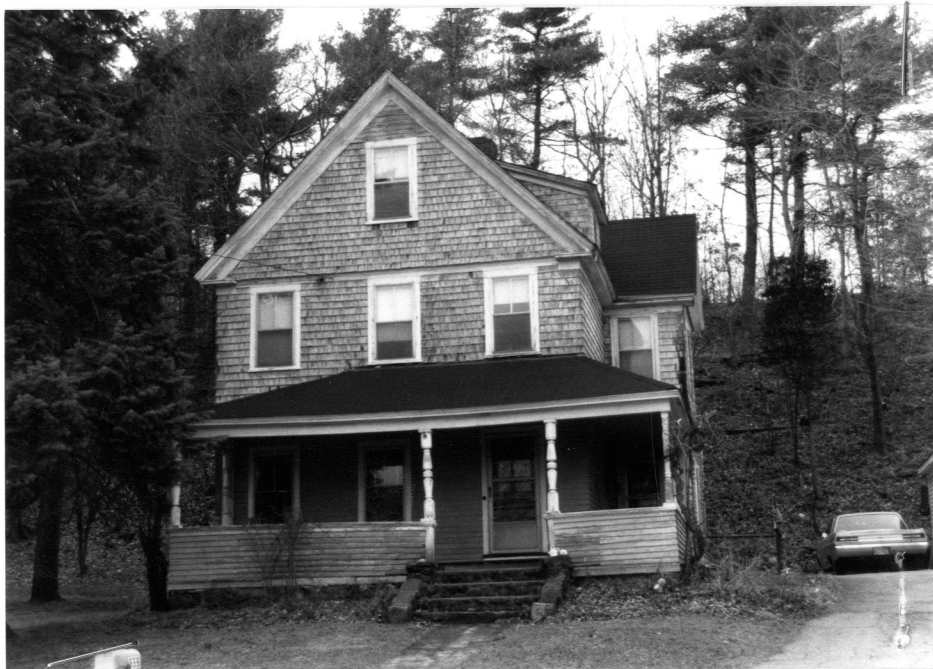
555 Lexington Road (CON. 1065)

MHC #/ Parcel # Address AREA DATA SHEET description date condition 1065 I9-4178 555 Lexington Road vernac. Victorian gable-end house Wood shingle. ca. 1895-8 good 1066 I9-4178 561 Lexington Road utilitarian store early 20th C. good