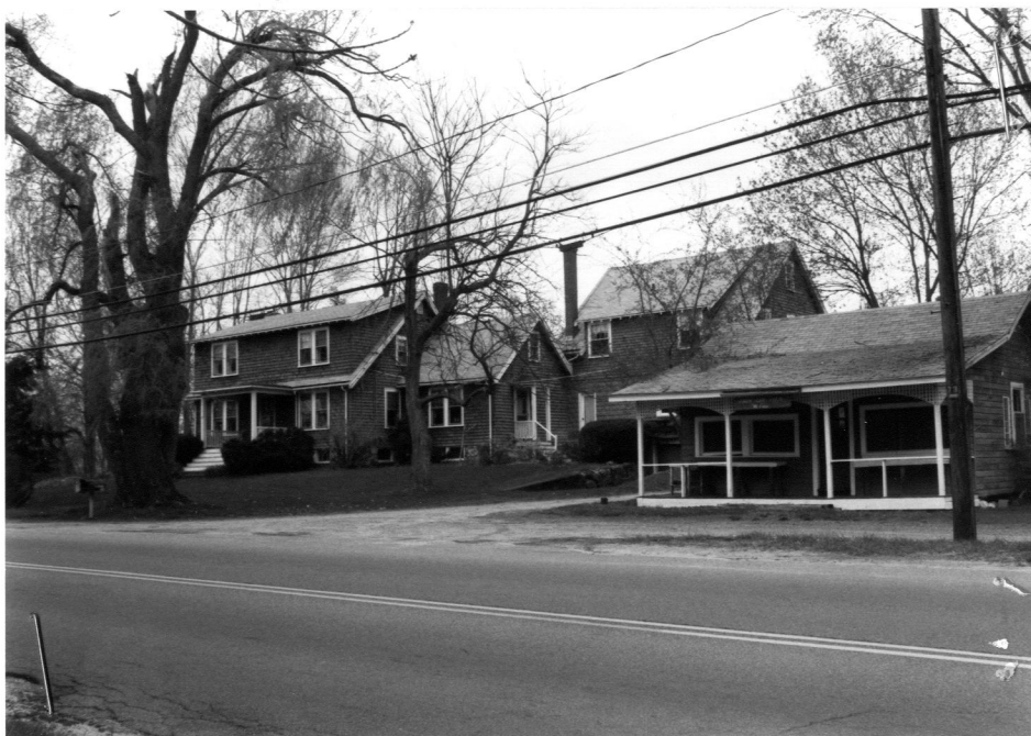
851 Lexington Road (CON. 355)

MHC #/ Parcel # Address description date condition 354 J9-4229-6 831 Lexington Road vernacular Italianate/Greek Revival Clapboard; brick foundation. - owned by M.M.W.P. ca. 1865 good 355 J9-4230 851/855 Lexington Road Craftsman cottage Wood shingle; rubble and concrete-block foundation. Drop-sided roadside stand with porch across facade ca. 1915-20 fair