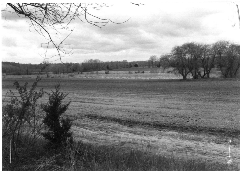
Farmland, looking Southwest from Shadyside Avenue (CON. 943)