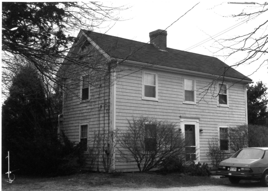
286 Shadyside Avenue (CON. 361)