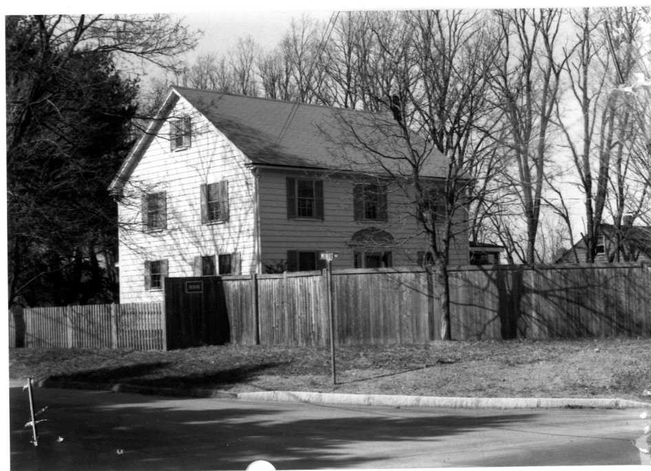
667 Old Bedford Road (CON. 1075)