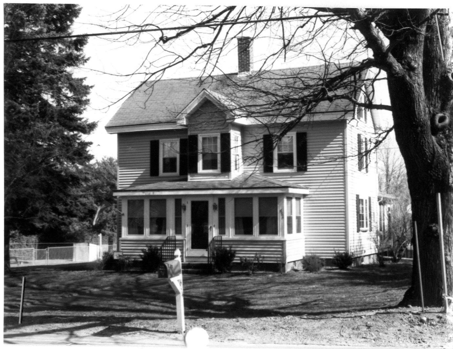
654 Old Bedford Road (CON. 1074)