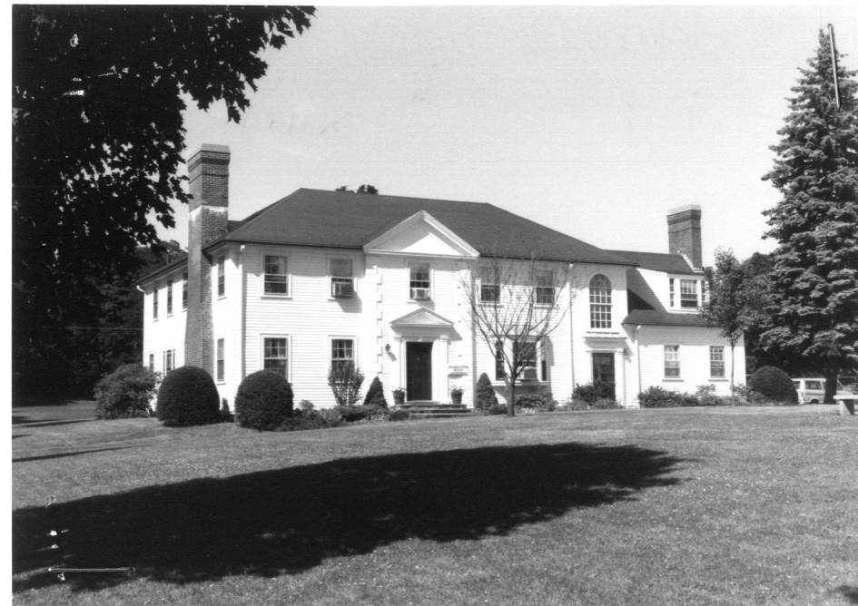
Fenn School Administrative Building