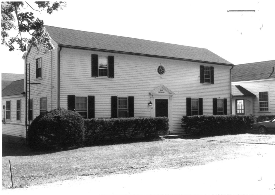
Fenn Hall Infirmary (CON. 1126)