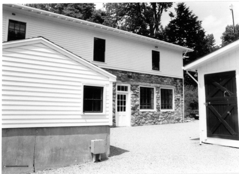
727 Monument Street