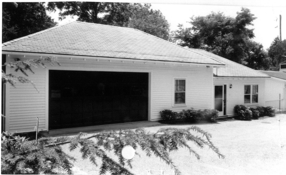
727 Monument Street (CON. 1132)