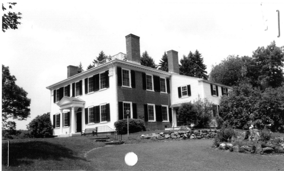
1061 Monument Street (CON. 1140)