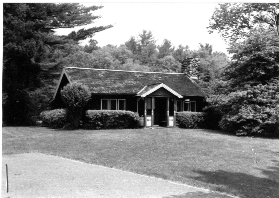
1077 Monument Street (CON. 1141)