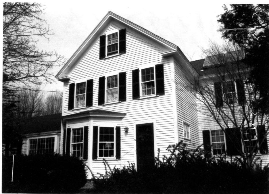
286 Barnett's Mill Road (CON. 1192)