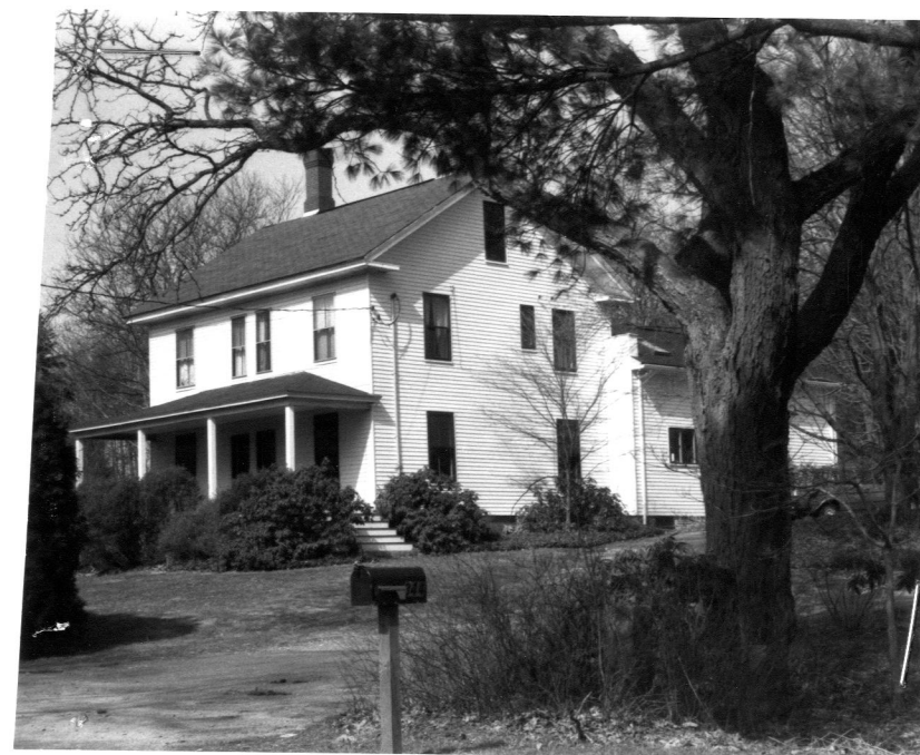
344 Barnett's Mill Road (CON. 1194)