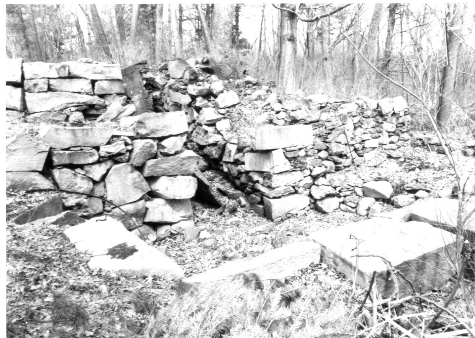
Remains of Barnett's Mill (CON. 951)