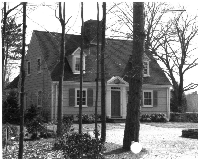
363 Barnett's Mill Road (CON. 1195)