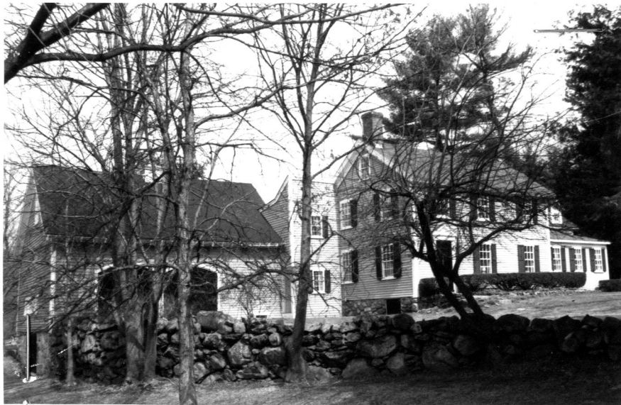
108 Barnett's Mill Road (CON. 1188)