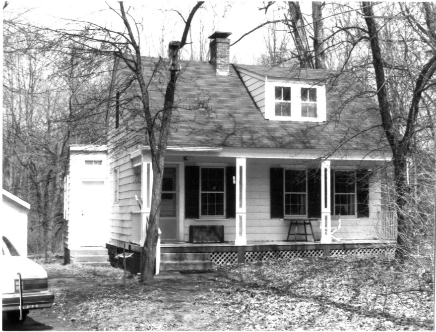
100 Barnett's Mill Road (CON 1187)