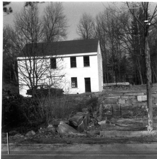
344 Barnett's Mill Road (CON. 1194)