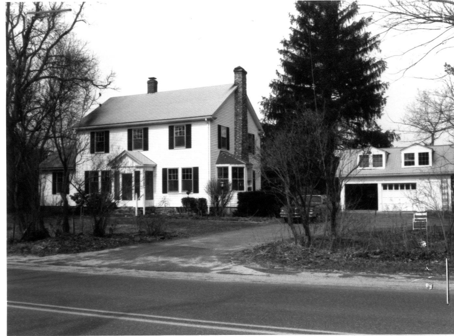
184 Barnett's Mill Road (CON. 1189)