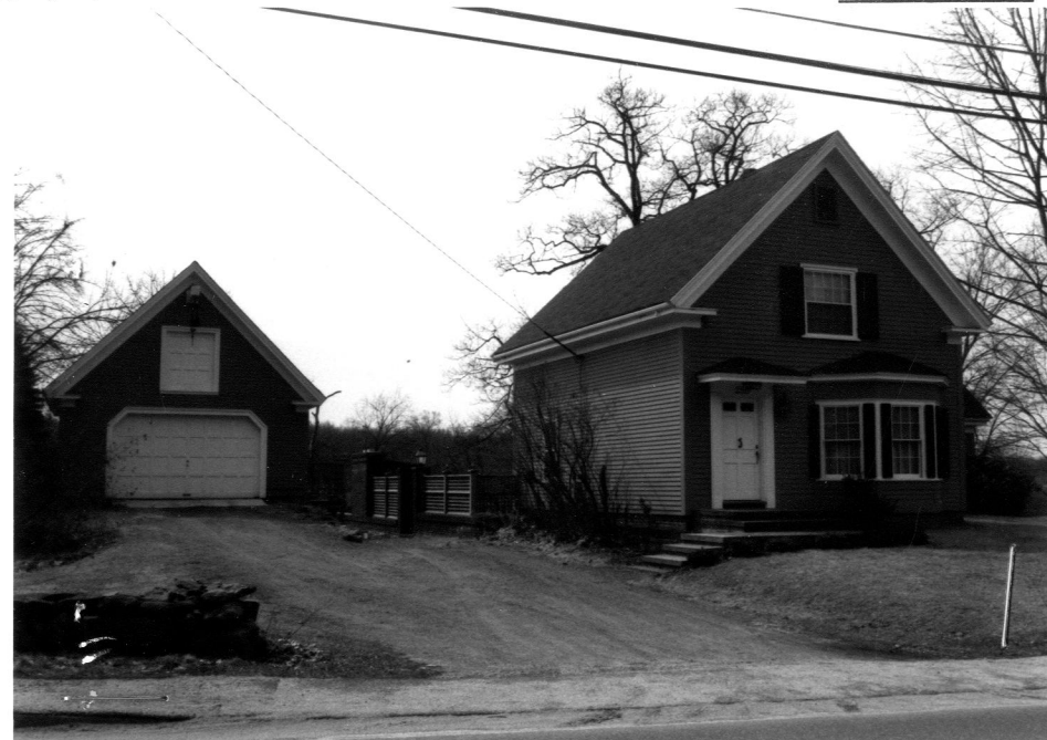
295 Barnett's Mill Road (CON. 1193)