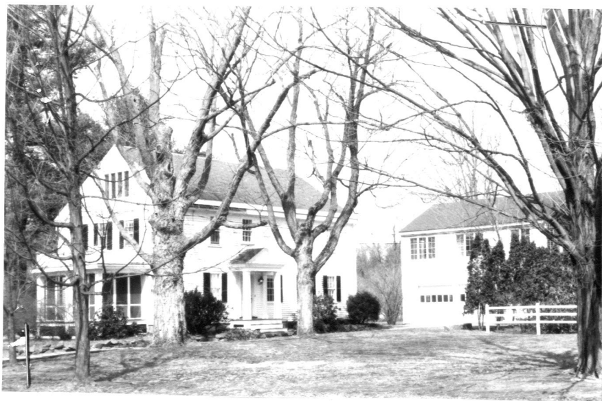
268 Barnett's Mill Road (CON. 1191)