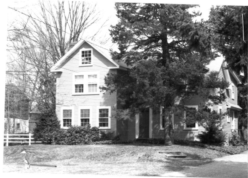
254 Barnett's Mill Road (CON. 1190)