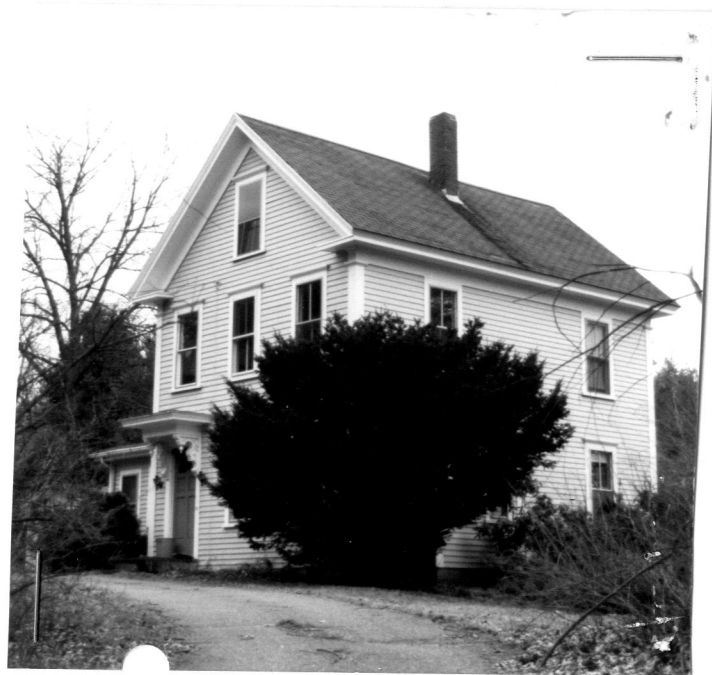
1273 Elm Street (CON. 1198)