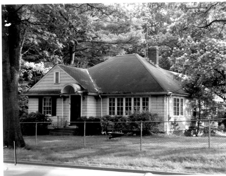
1245 Elm Street (CON. 1196)