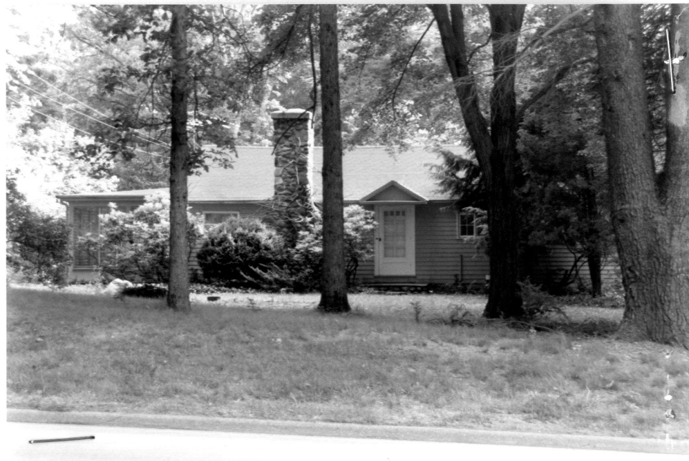
1287 Elm Street (CON. 1199)