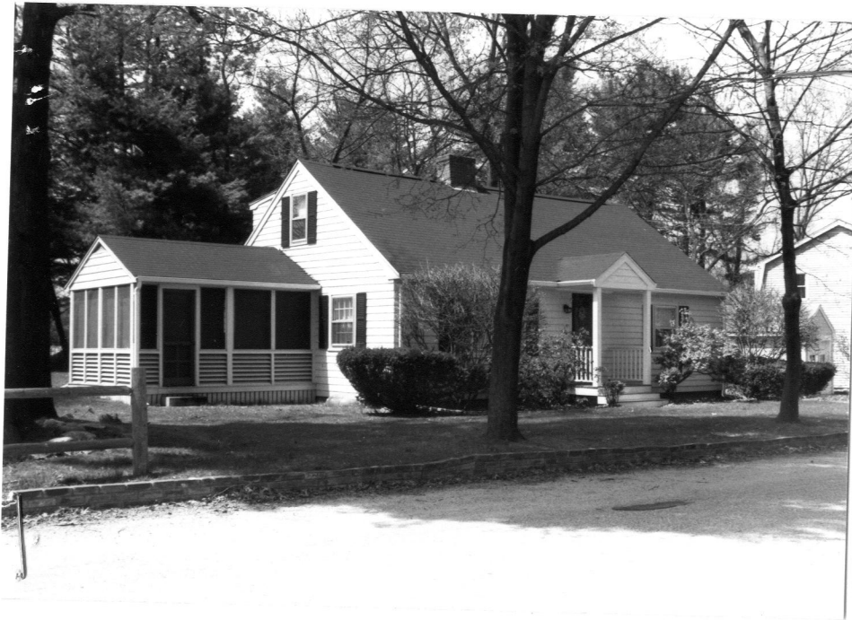
21 Hillside Avenue (CON. 1202)