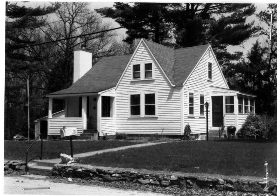
36 Hillside Avenue (CON. 1204)