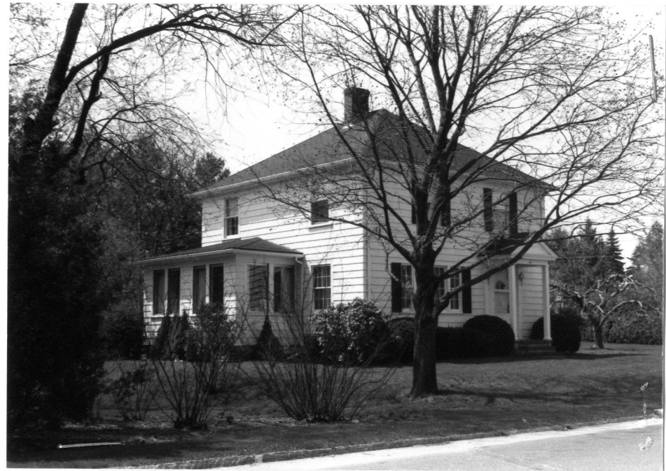
143 Hillside Avenue (CON. 1210)