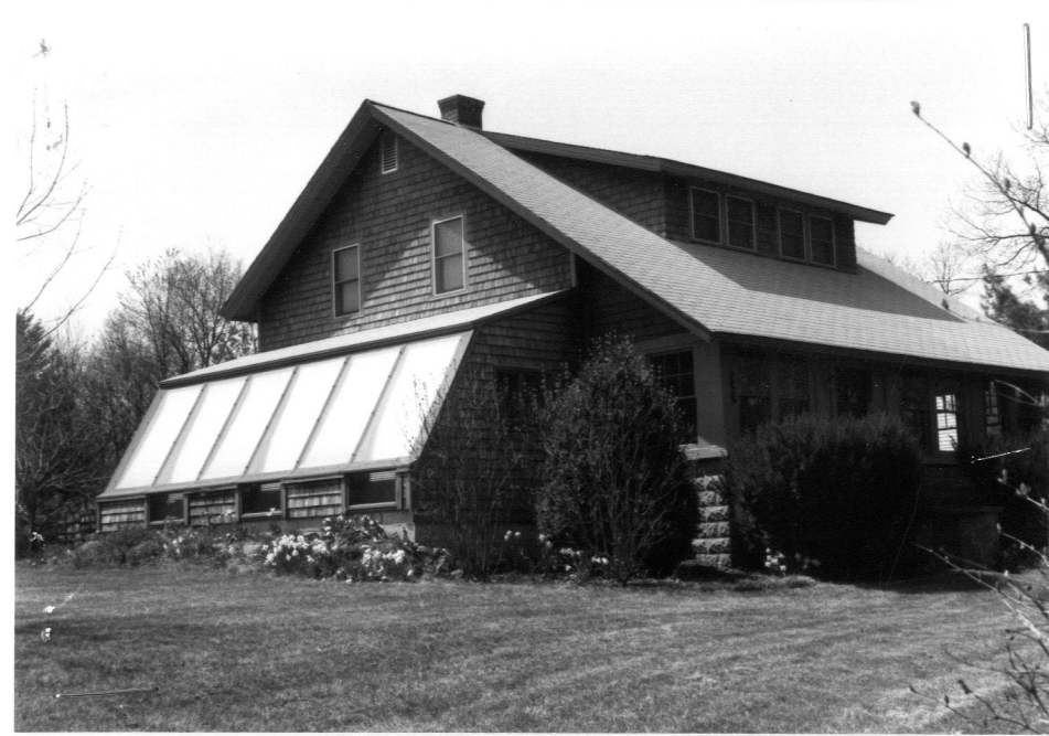
113 Hillside Avenue (CON. 1209)