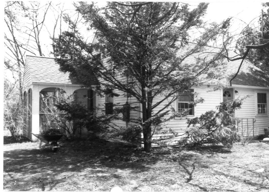
26 Hillside Avenue (CON. 1203)