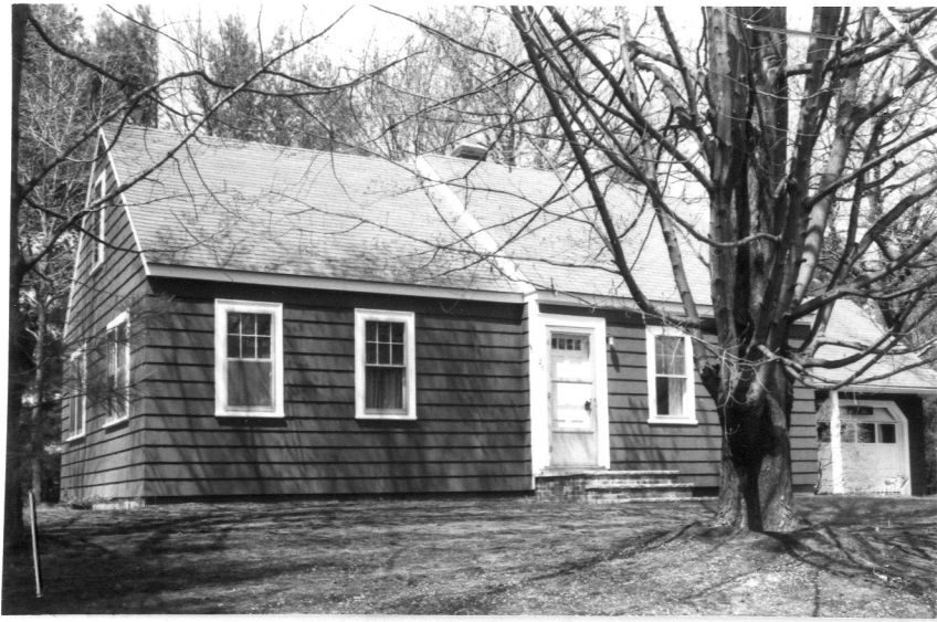
20 Mill Street (CON. 1211)