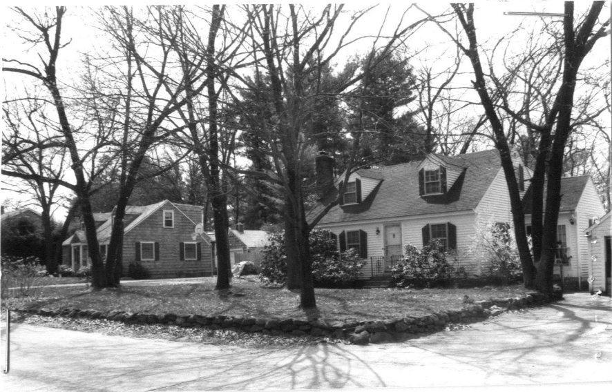
41 and 51 Hillside Avenue (CON. 1205 and CON. 1206)