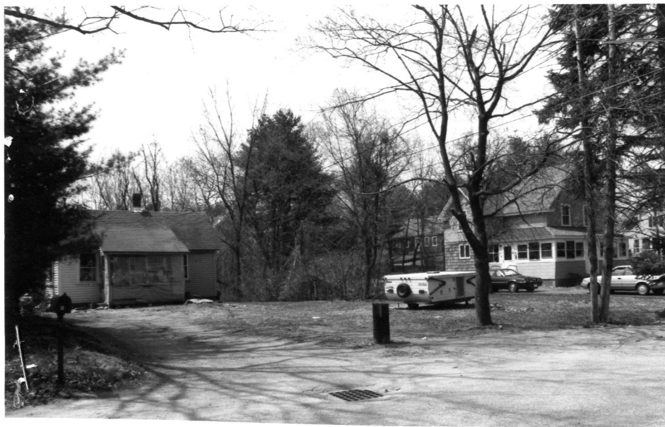
59 and 69 Hillside Avenue (CON. 1207 and CON. 1208)