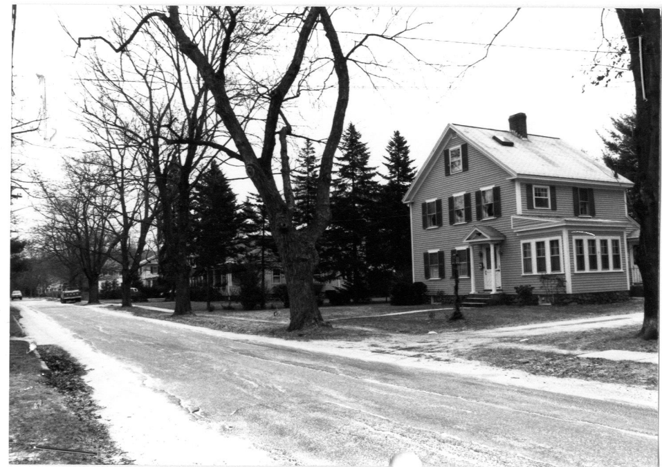
Upland Road, looking East