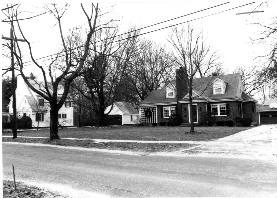
56 and 66 Upland Road (CON. 1215 and CON. 1216)