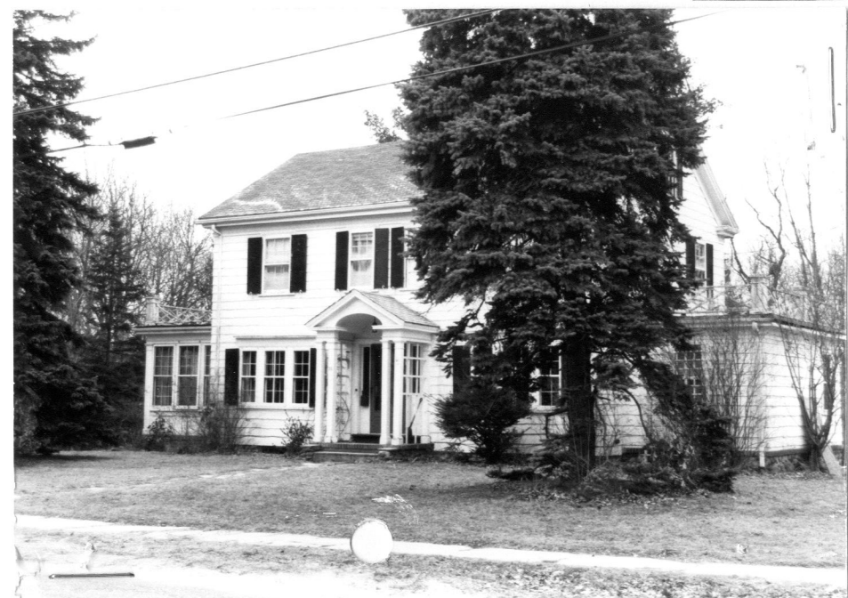
76 Upland Road (CON. 1218)