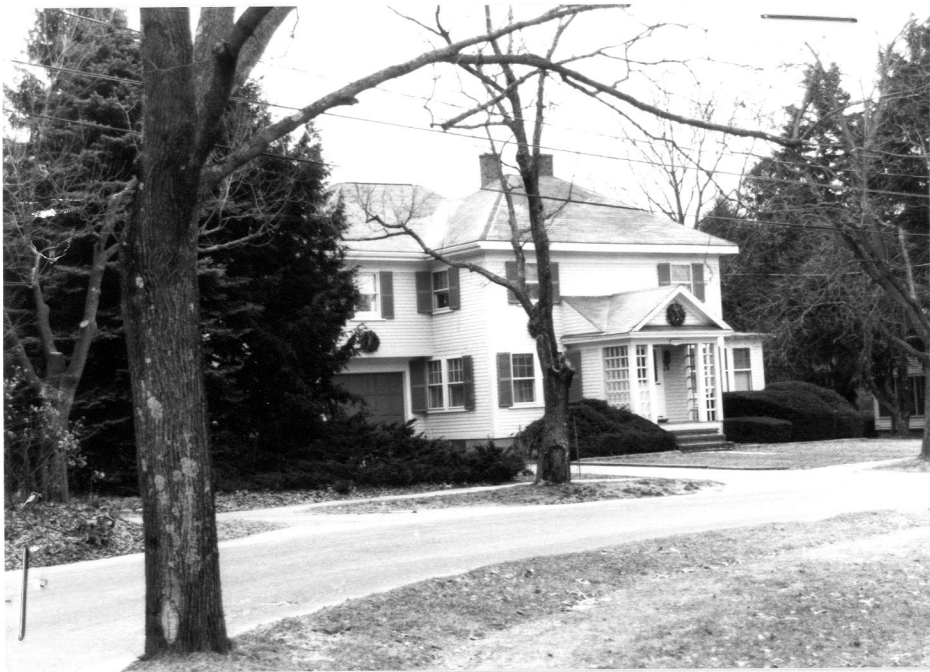
40 Upland Road (CON. 1213)