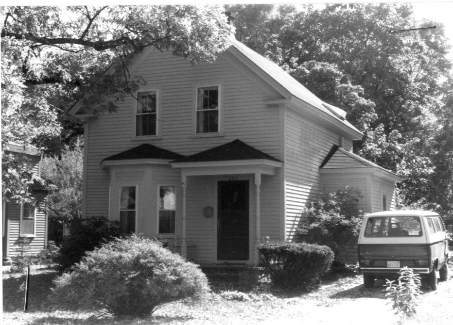
855 Barnett's Mill Road (CON. 1771)