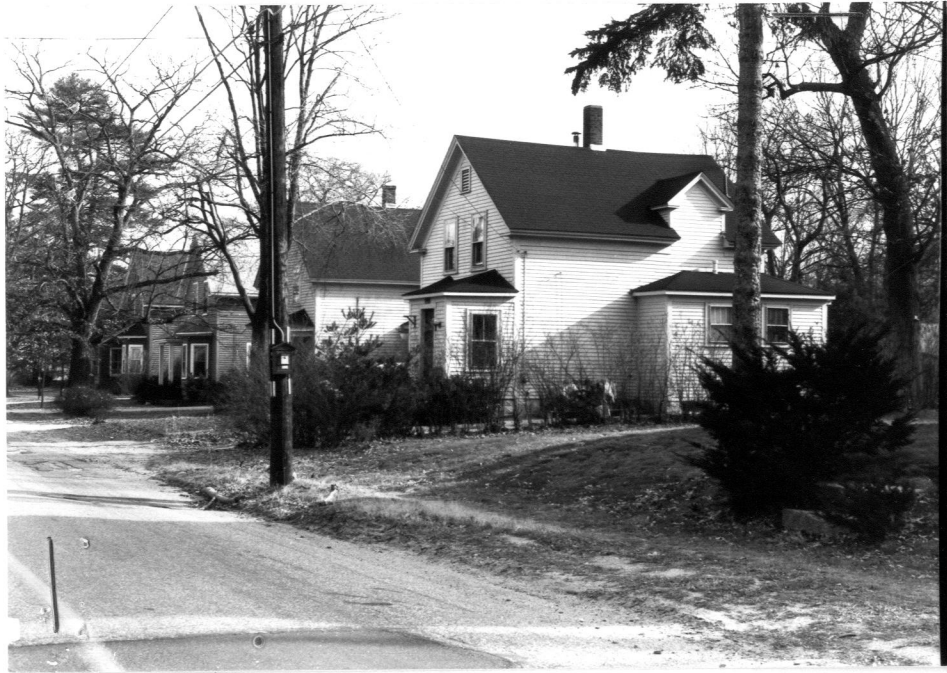
845-861 Barnett's Mill Road