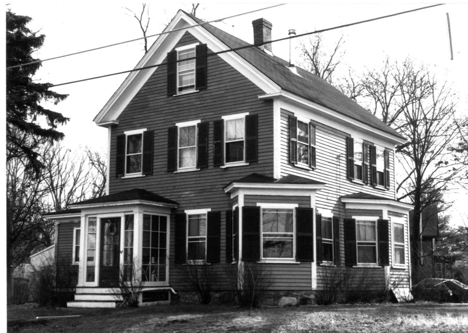
869 Barnett's Mill Road (CON. 1773)