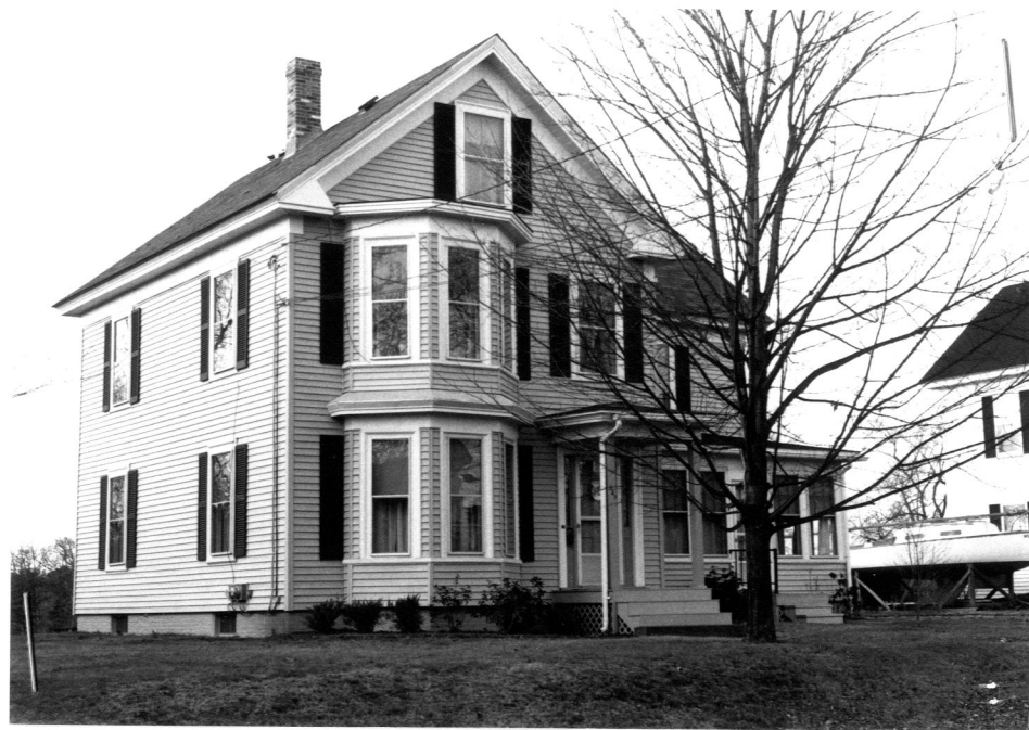
327 Commonwealth Avenue (CON. 1369)