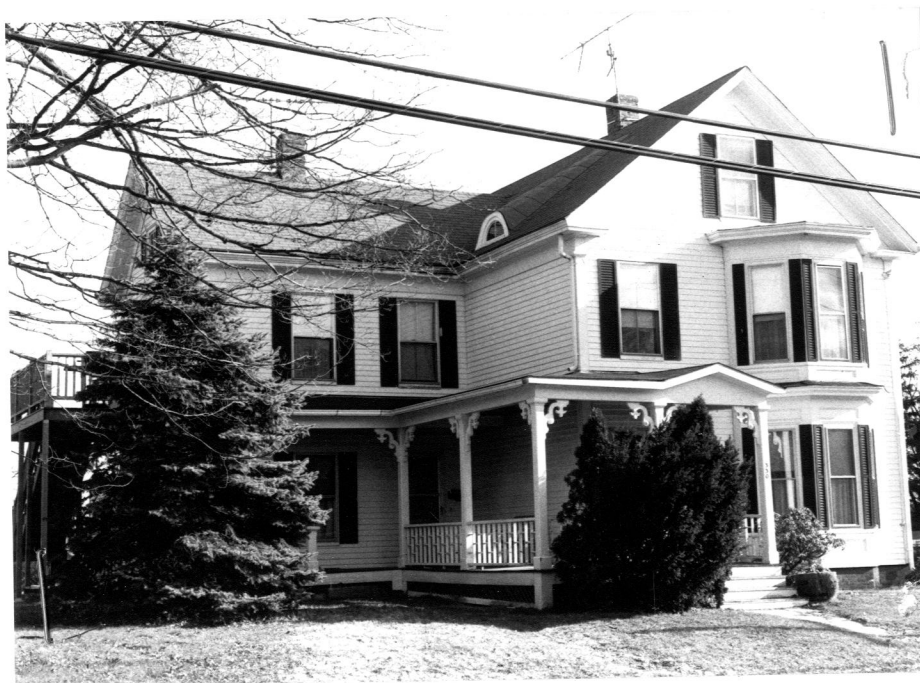
330 Commonwealth Avenue (CON. 1370)