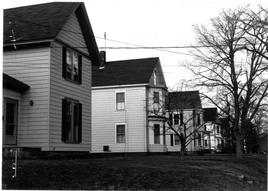
311/13, 317/19, 327, 335 (CON. 1365), (CON. 1367), (CON. 1369), (CON. 1371)