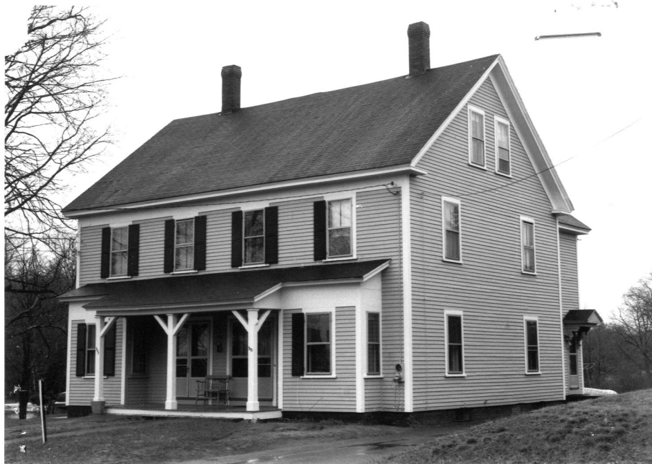
303/305 Commonwealth Avenue (CON. 1363)