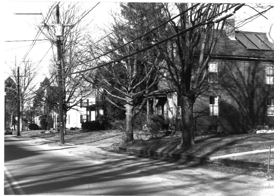
316-338 Commonwealth Avenue