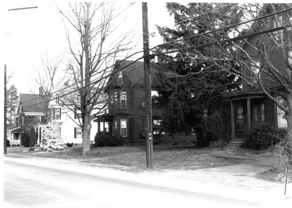
316-338 Commonwealth Avenue