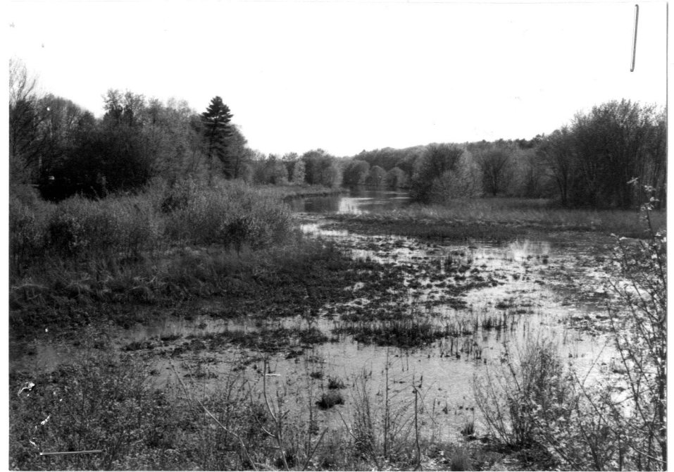
Assabet River at Westvale, Looking West from Damon Mill