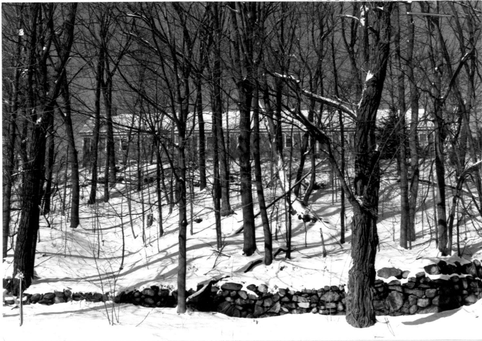
The Mill Block, Feb. 1988