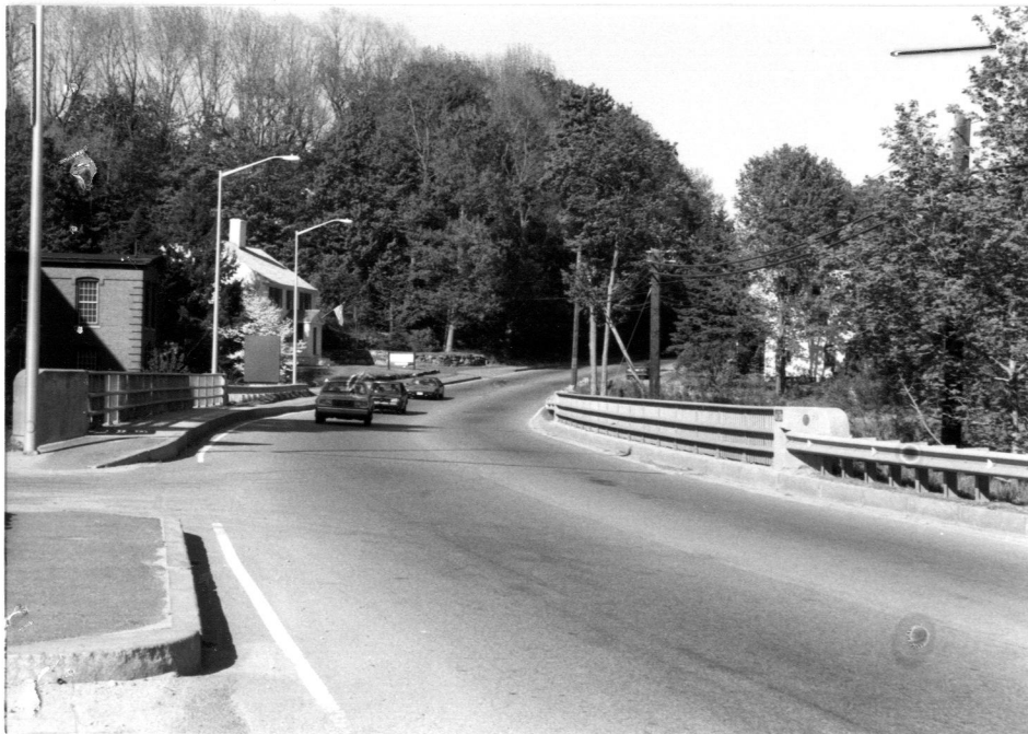
"Factory Village" at Assabet River/Main Street