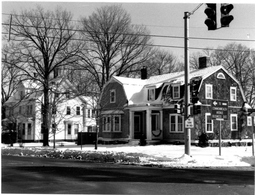
1295, 1305 Main Street (CON. 1505, CON. 1506)