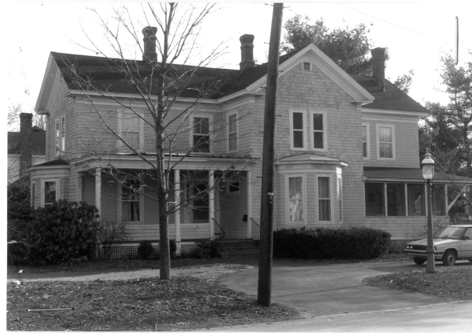
1391 Main Street