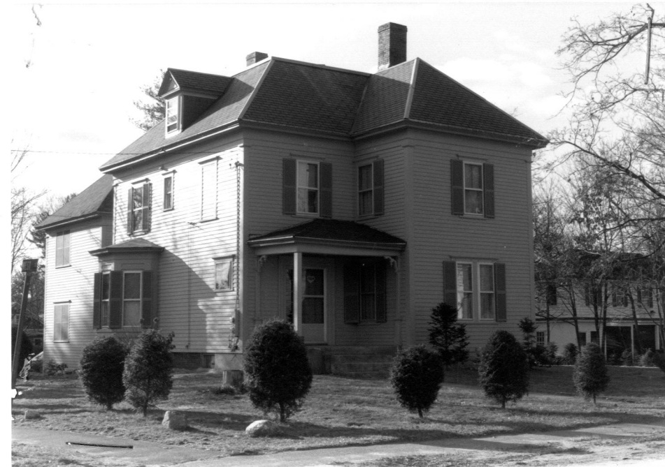
1405 Main Street (CON. 1514)