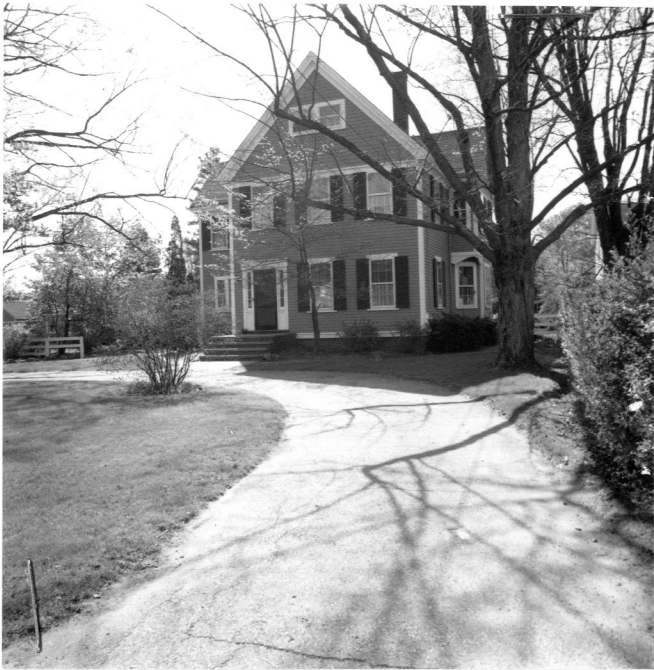
1289 Main Street (CON. 1504)