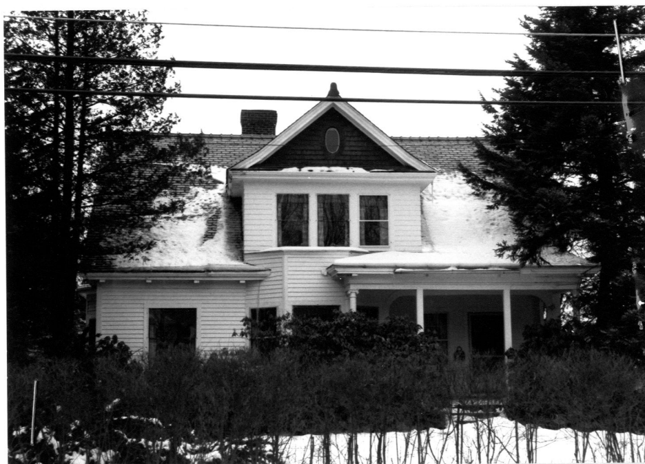
1489 Main Street (CON. 1524)

The houses here are also marked by a great variety of window designs, including a multiplicity of rectangular sash combinations, and many other shapes as well--lunettes and an oriel at #1461, a vertical oval at #1489, and a Palladian at #1461.