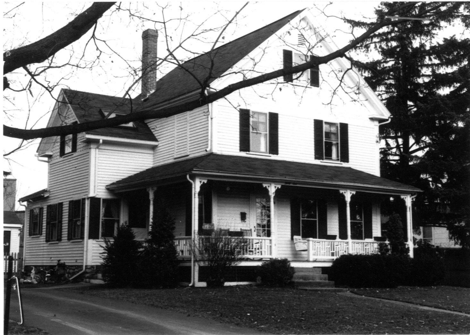
41 Central Street (CON.1545)