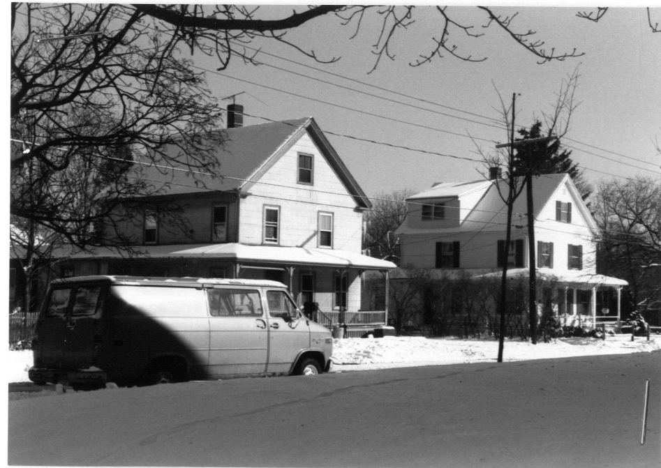
45 and 51 Pine Street (CON.1614 and CON.1615)