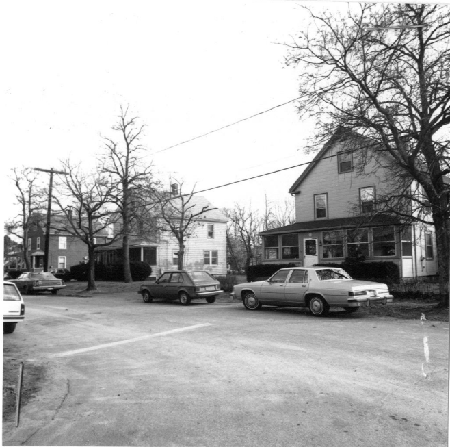
49, 57, 65 Central Street (CON.1547, CON.1549, CON.1550)