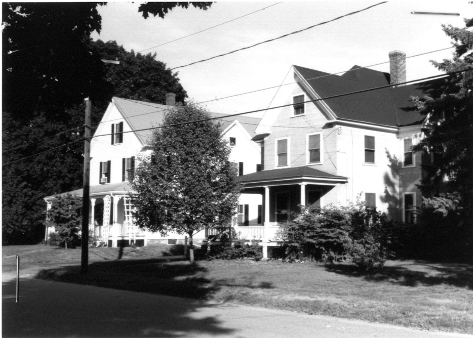
89/91 and 95 Central Street (CON. 462 and CON. 1553)

Indicate each item on inventory form which is being continued below.