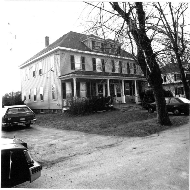
117/119 Central Street (CON. 1559)