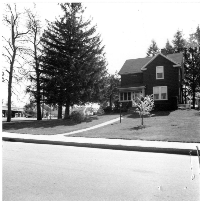
7 Cottage Street (CON. 1672)