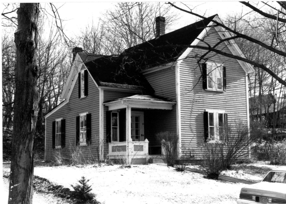
31 Cottage Street (CON. 1675)