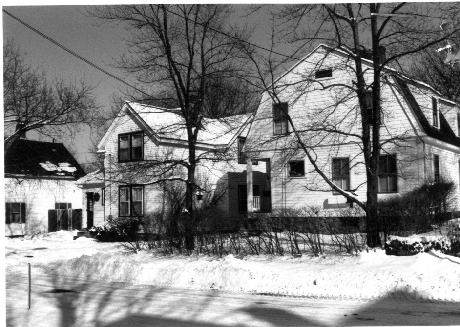
16, 20, 26 Damon Street (CON. 1286, CON. 1288, CON. 1290)