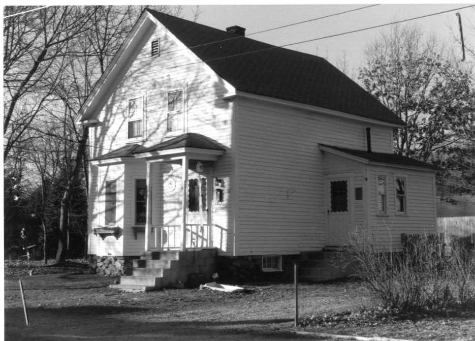
39 Damon Street (CON. 1293)