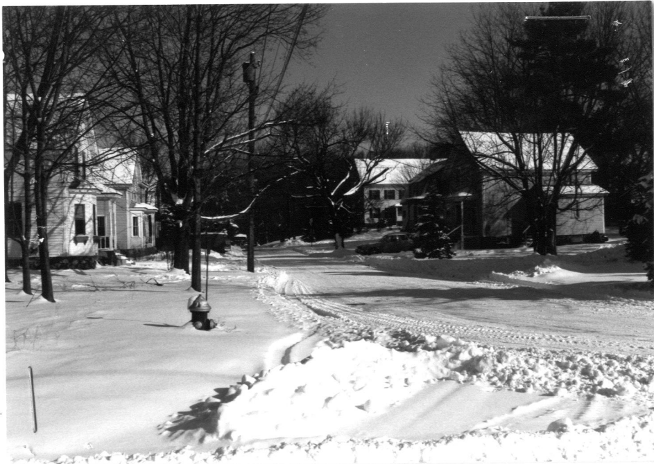
Damon Street, looking East.