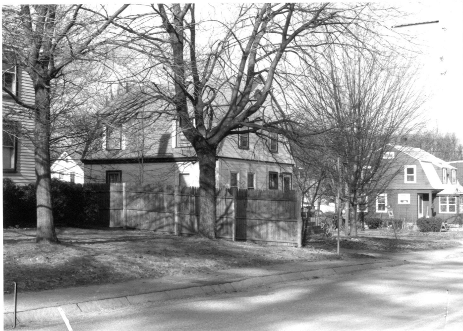
188 Conant Street 51 Damon Street (CON. 1282), (CON. 1296)