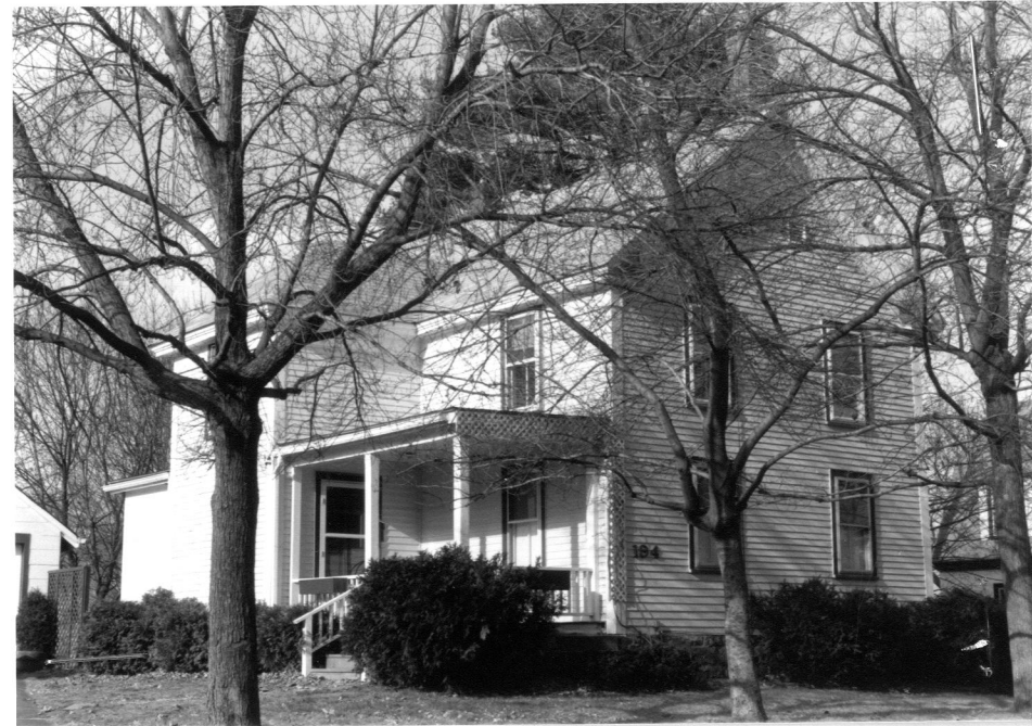
194 Conant Street (CON. 1284)