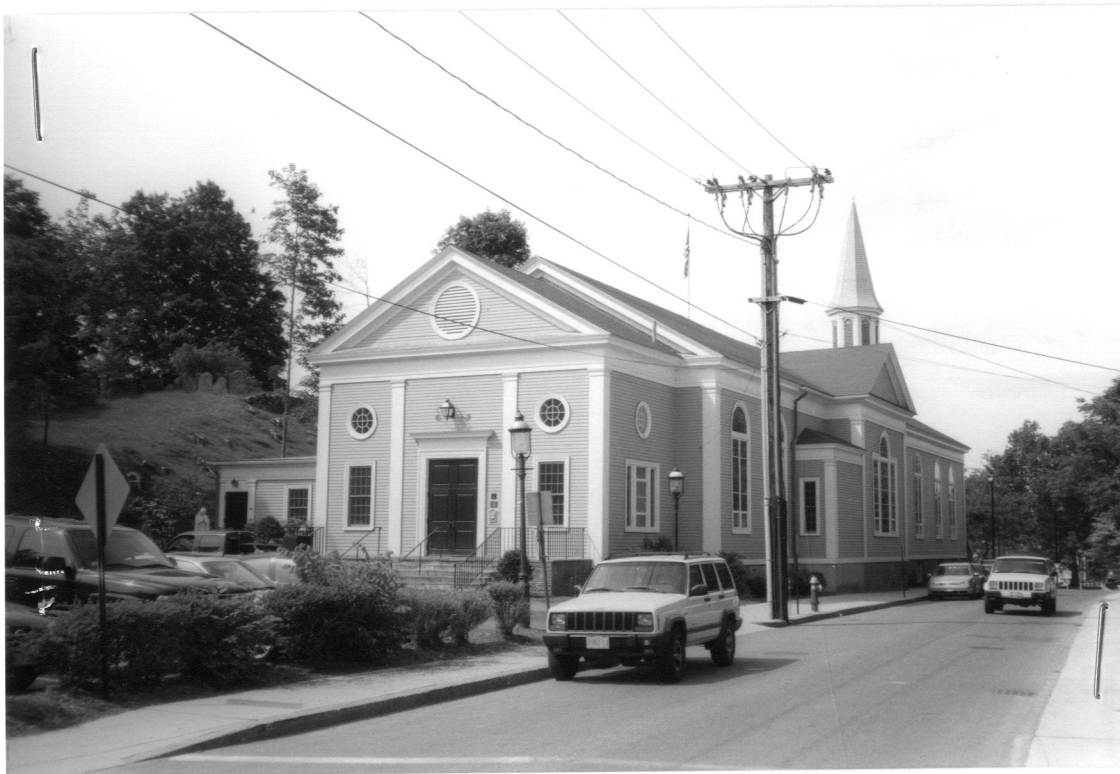
Church from Northeast C-real elevation) (CON-303)