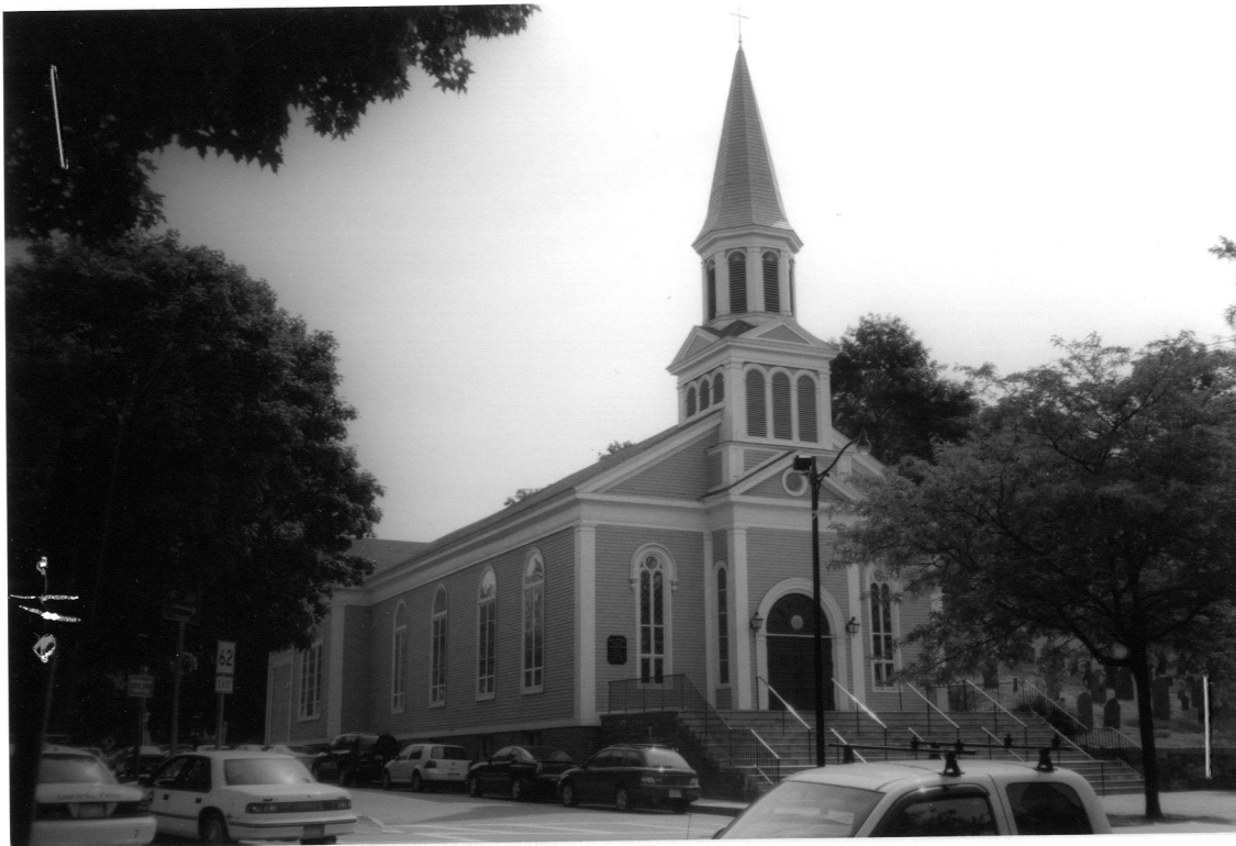
Church from Southwest (CON-303)