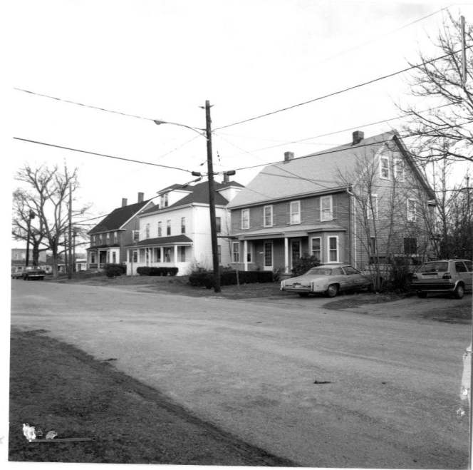
11-27 Dorsey Street