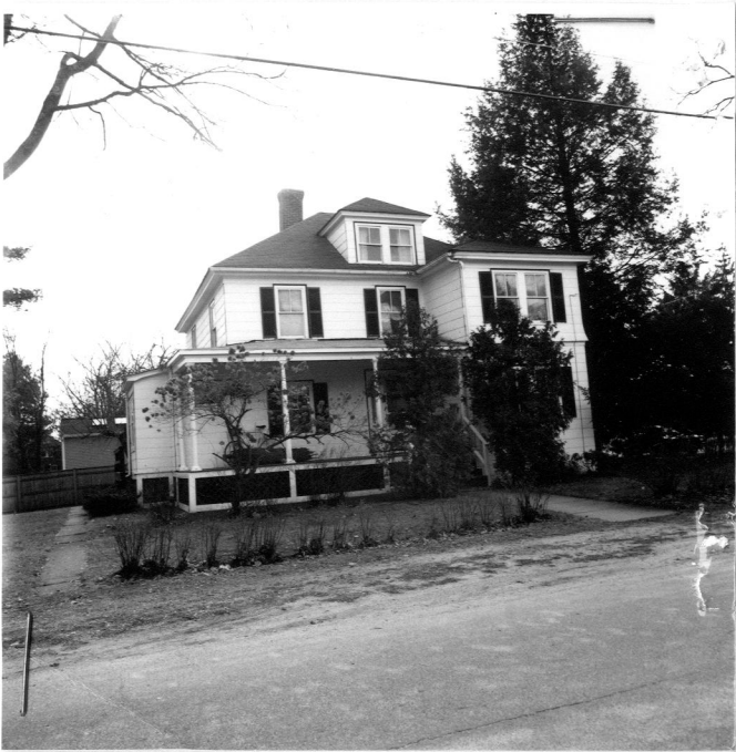
149 Central Street (CON. 1566)