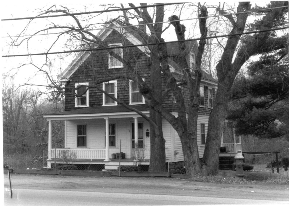
900 Main Street (CON. 1717)