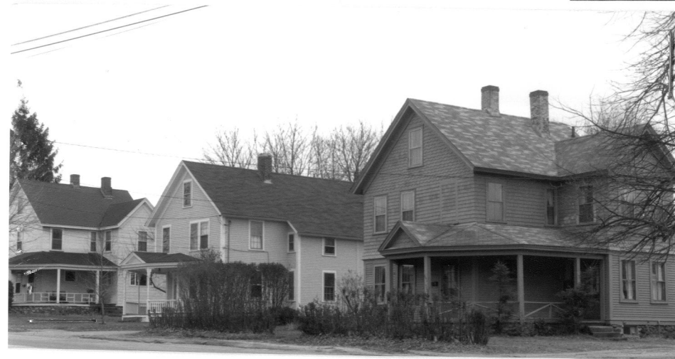
1031-1045 Main Street