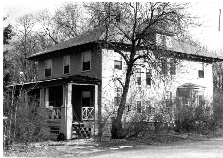
21 Old Bridge Road (CON. 1729)