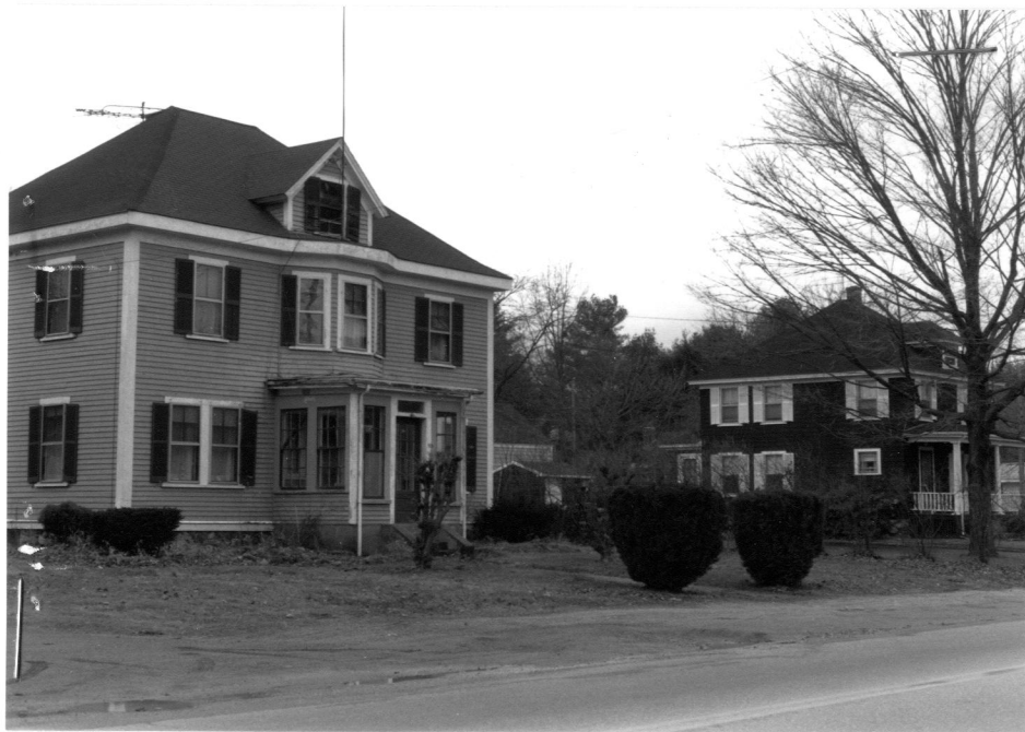
905, 915 Main Street (CON. 1718, CON. 1719)