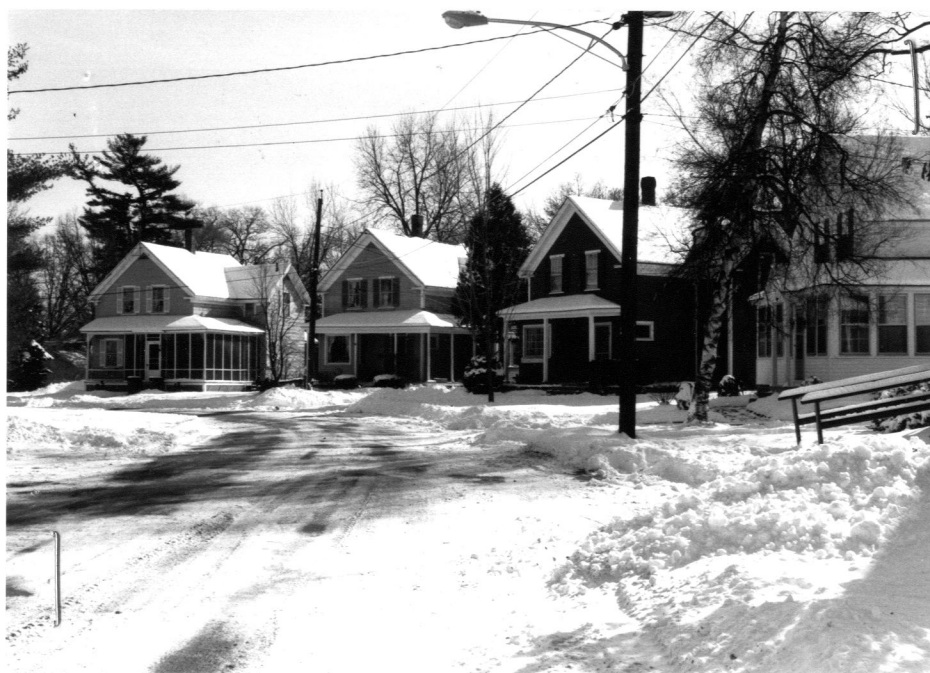
97-109 Grove Street