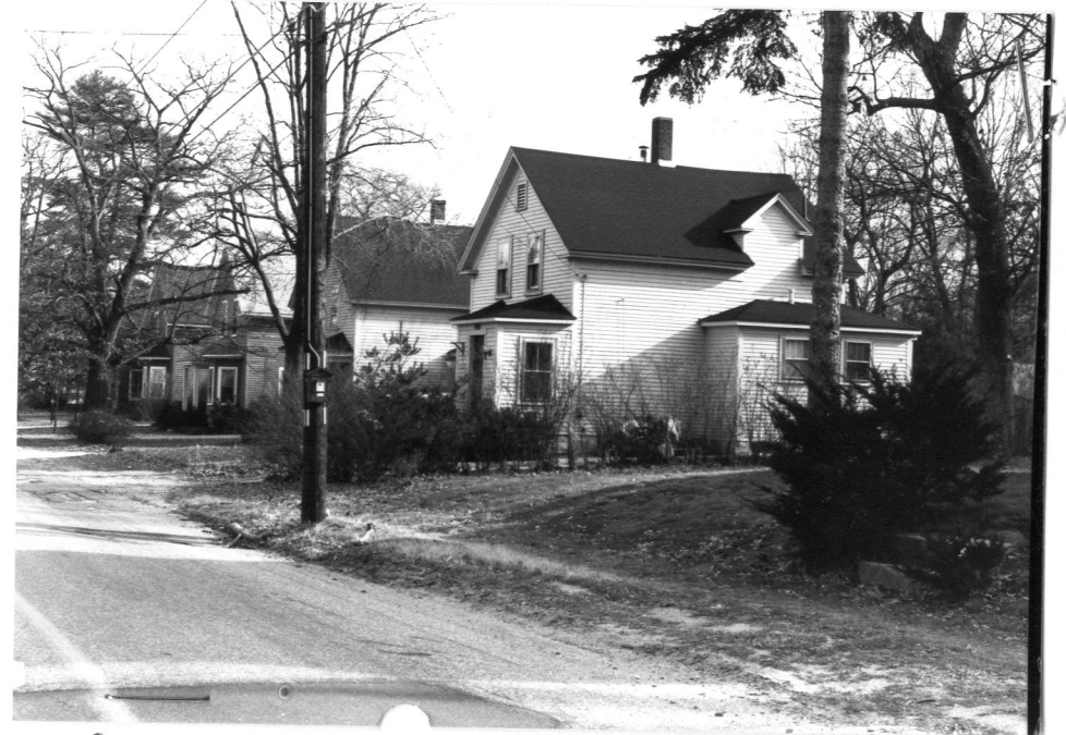
845-861 Barrett's Mill Road