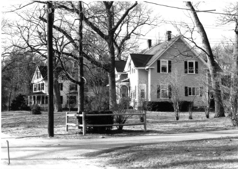
29 + 39 Assabet Avenue (CON. 1749 + CON. 1750)