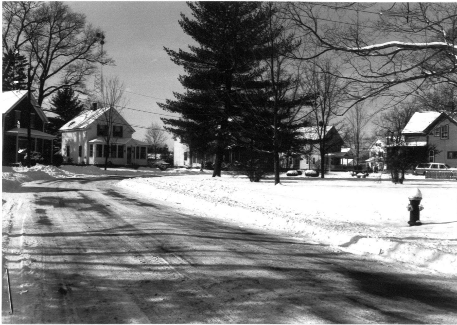
Grove Street, looking West