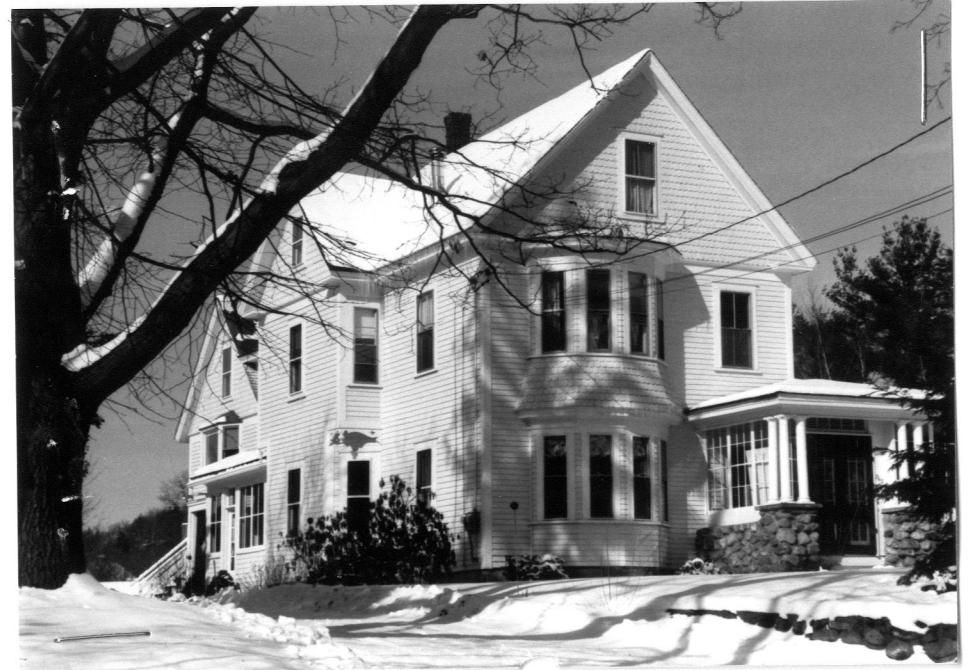
762 Barrett's Mill Road (CON. 1760)