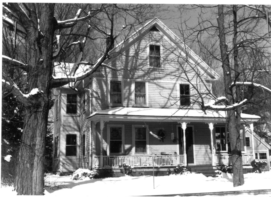
86 Grove Street (con. 1785)