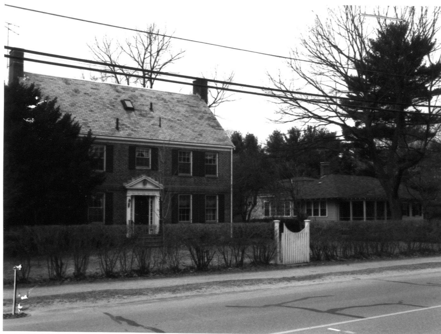
145 Monument Street (CON. 508)