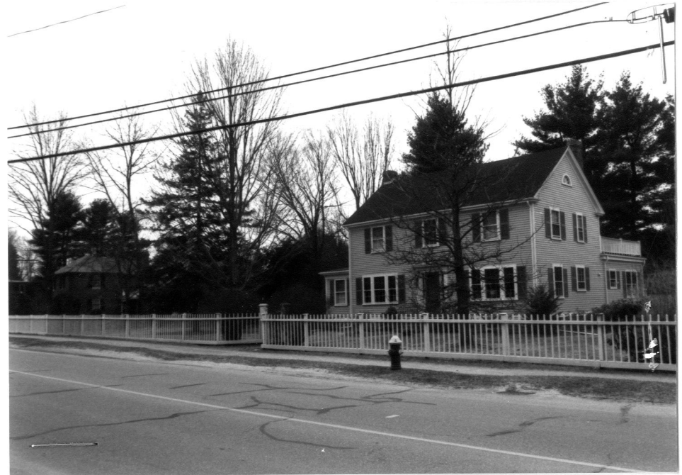
131 Monument Street (CON. 506)