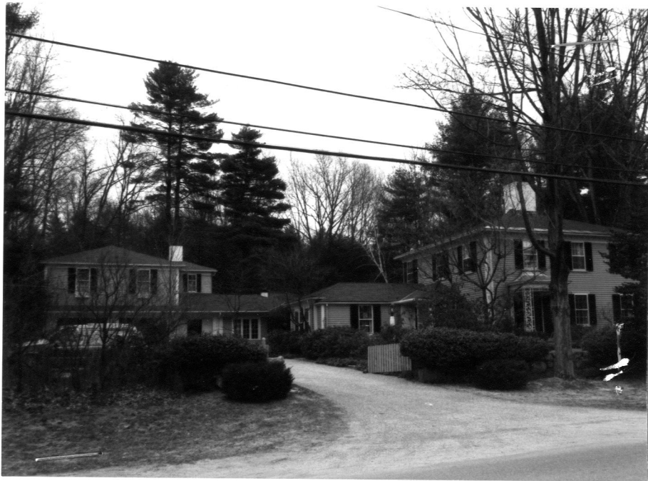
116 Monument Street (CON. 505)