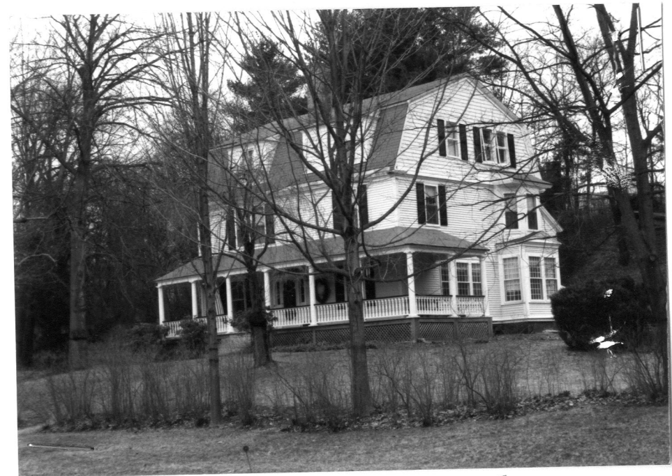
140 Monument Street (CON. 507)