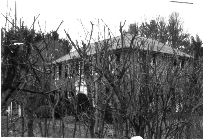
111 Monument Street (CON. 504)