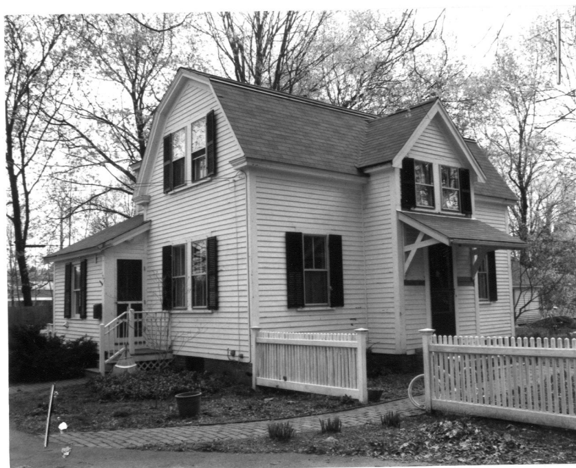
101 Main Street (CON. 525)