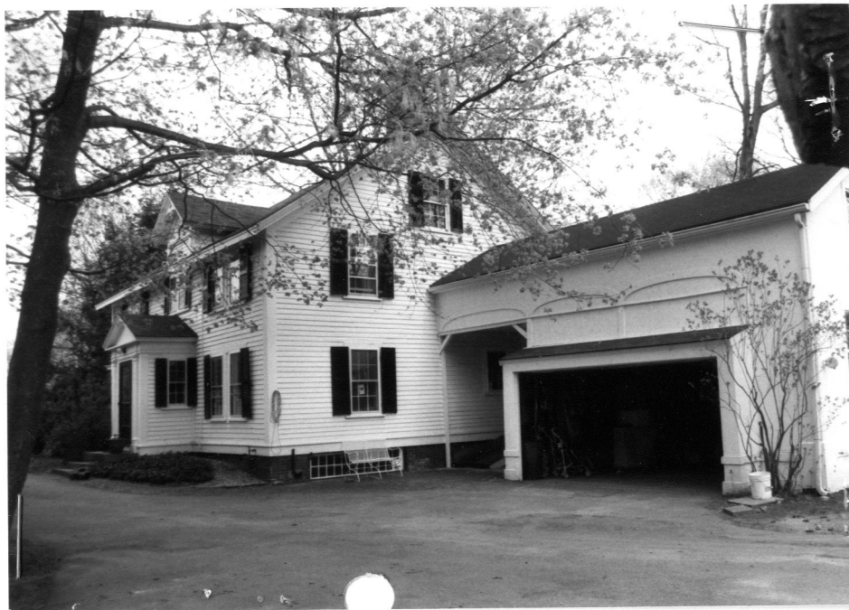
99 Main Street (CON. 524)