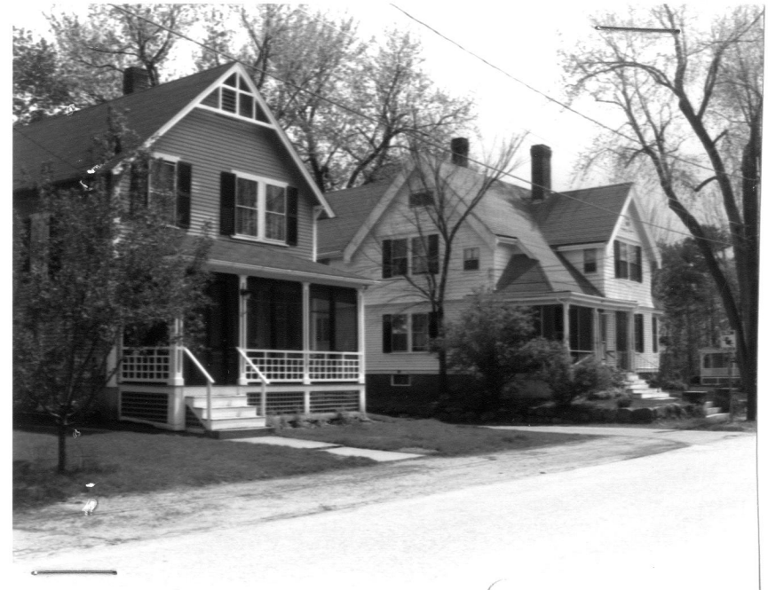
211-205 Hubbard Street (CON. 371 and CON. 552)