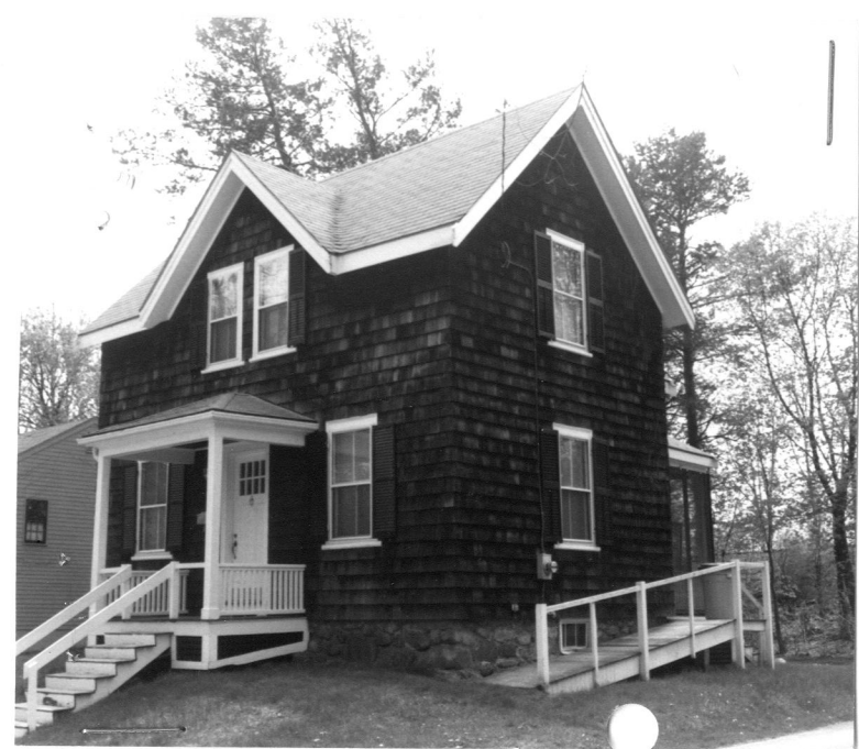
8 Union Street (CON. 569)