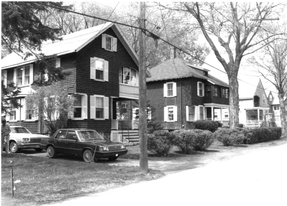
Fielding Street - West side