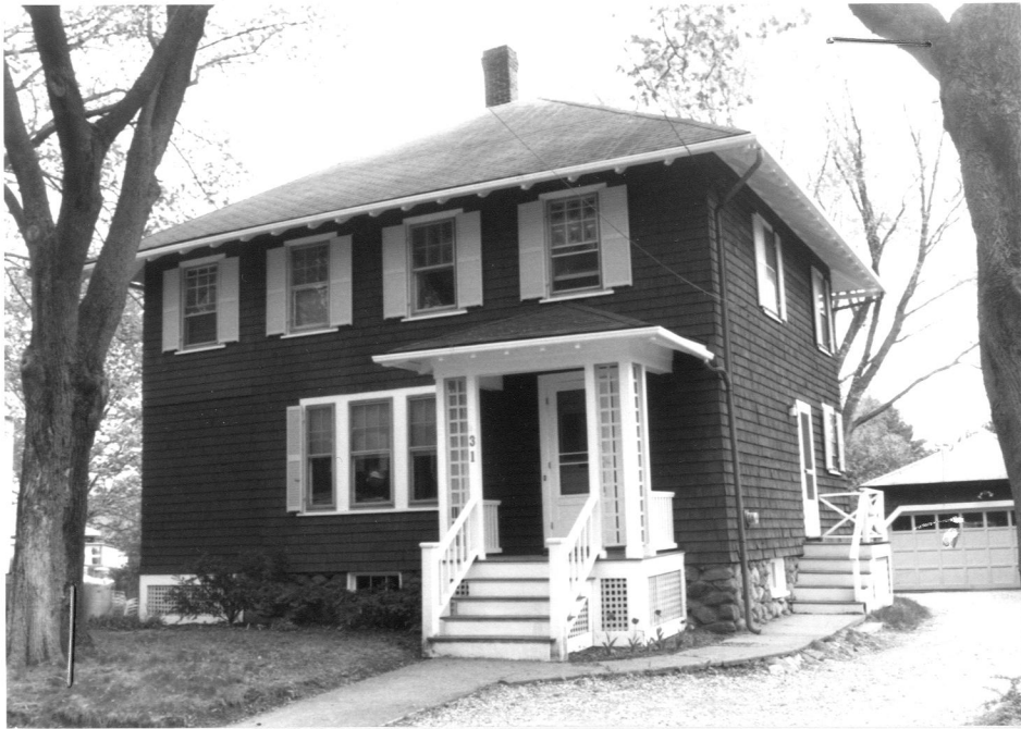
31 Fielding Street (CON. 583)